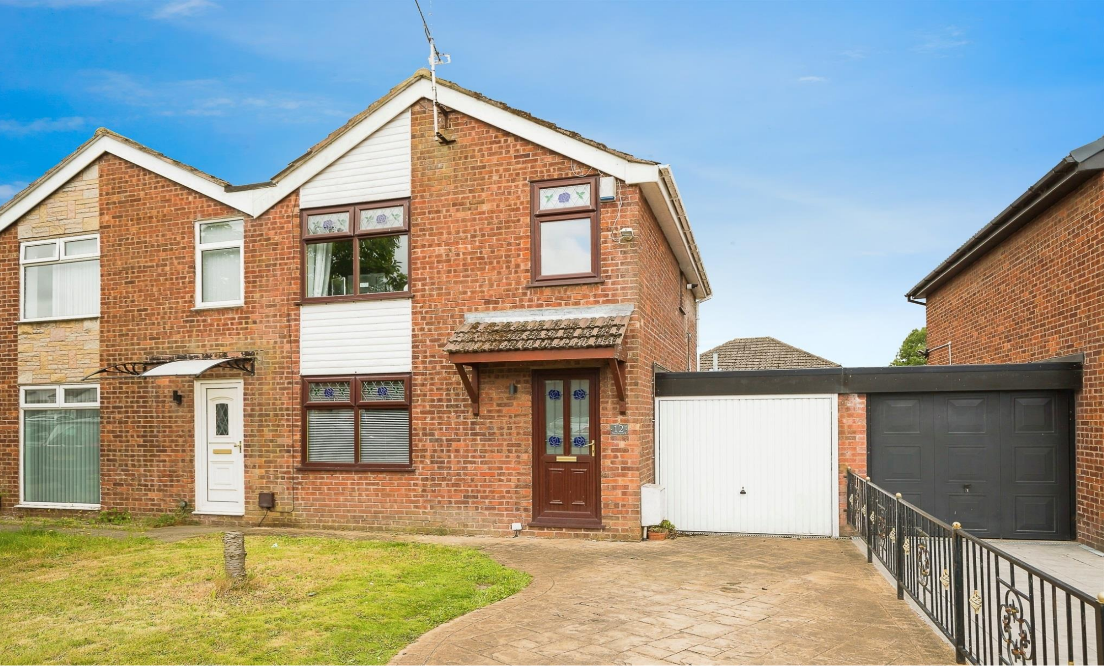
The Paddock, Elton Chester CH2 4PT