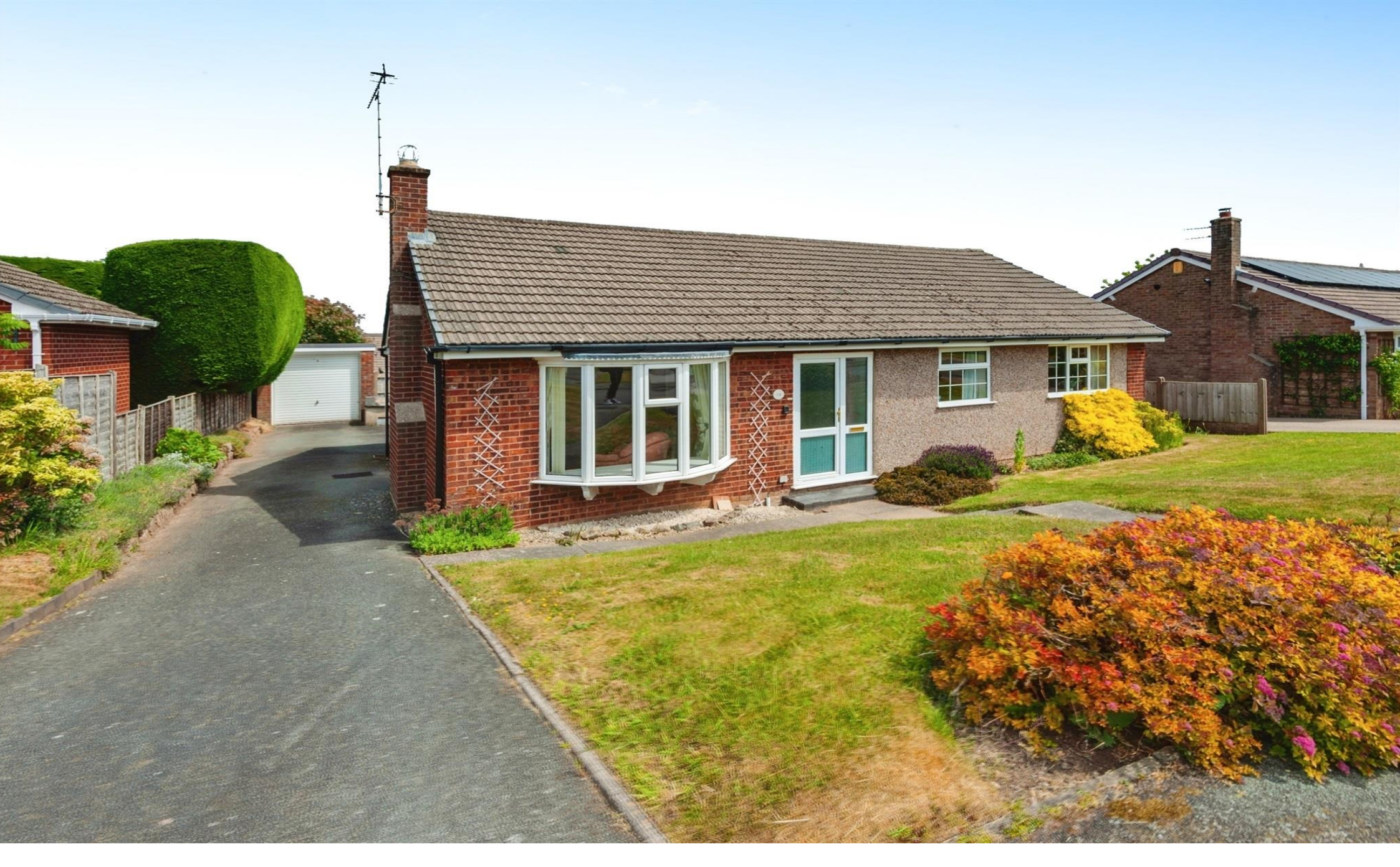
Hunters Hill, Kingsley Frodsham WA6 8DE