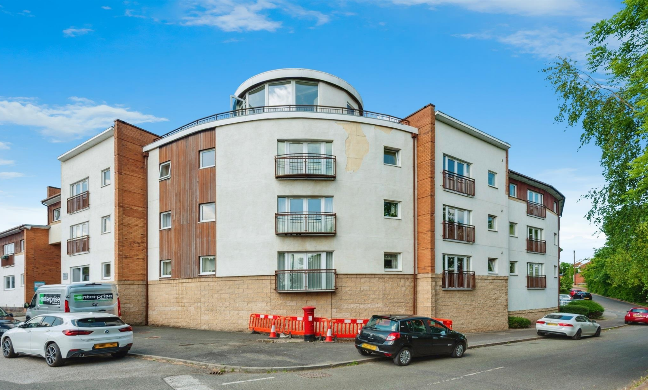
Bridge Lane Mews, Bridge Lane, Frodsham WA6 7JY