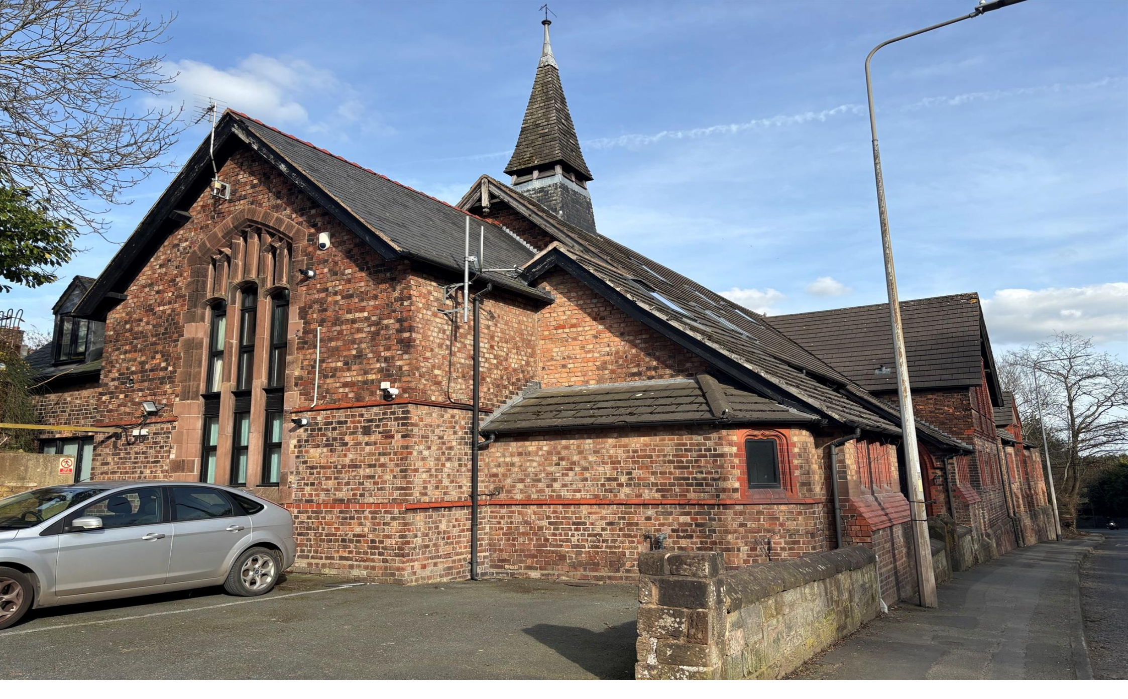
The Chapter House Bridge Lane, Frodsham WA6 7HN