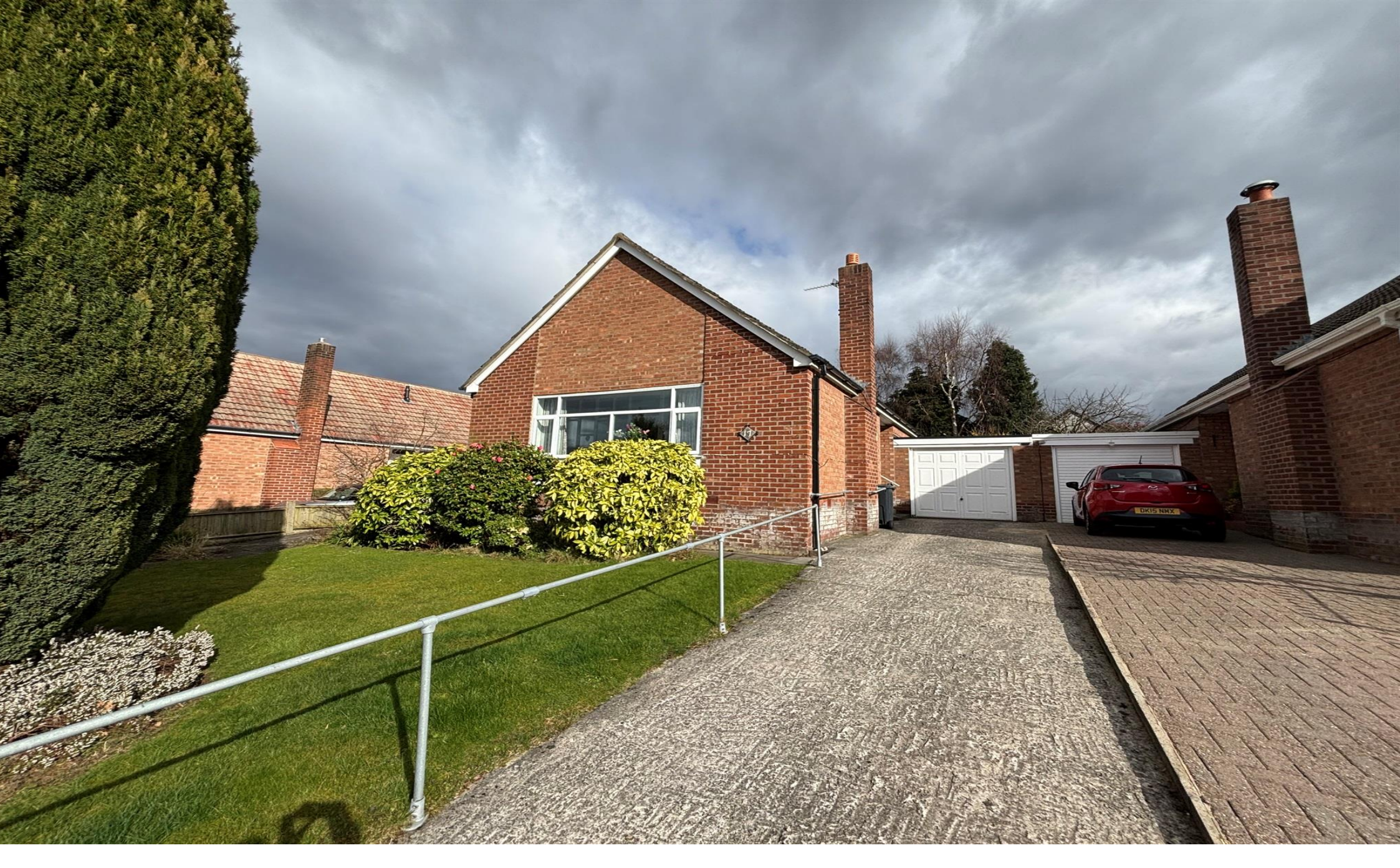
Grasmere Road, Frodsham WA6 7LP