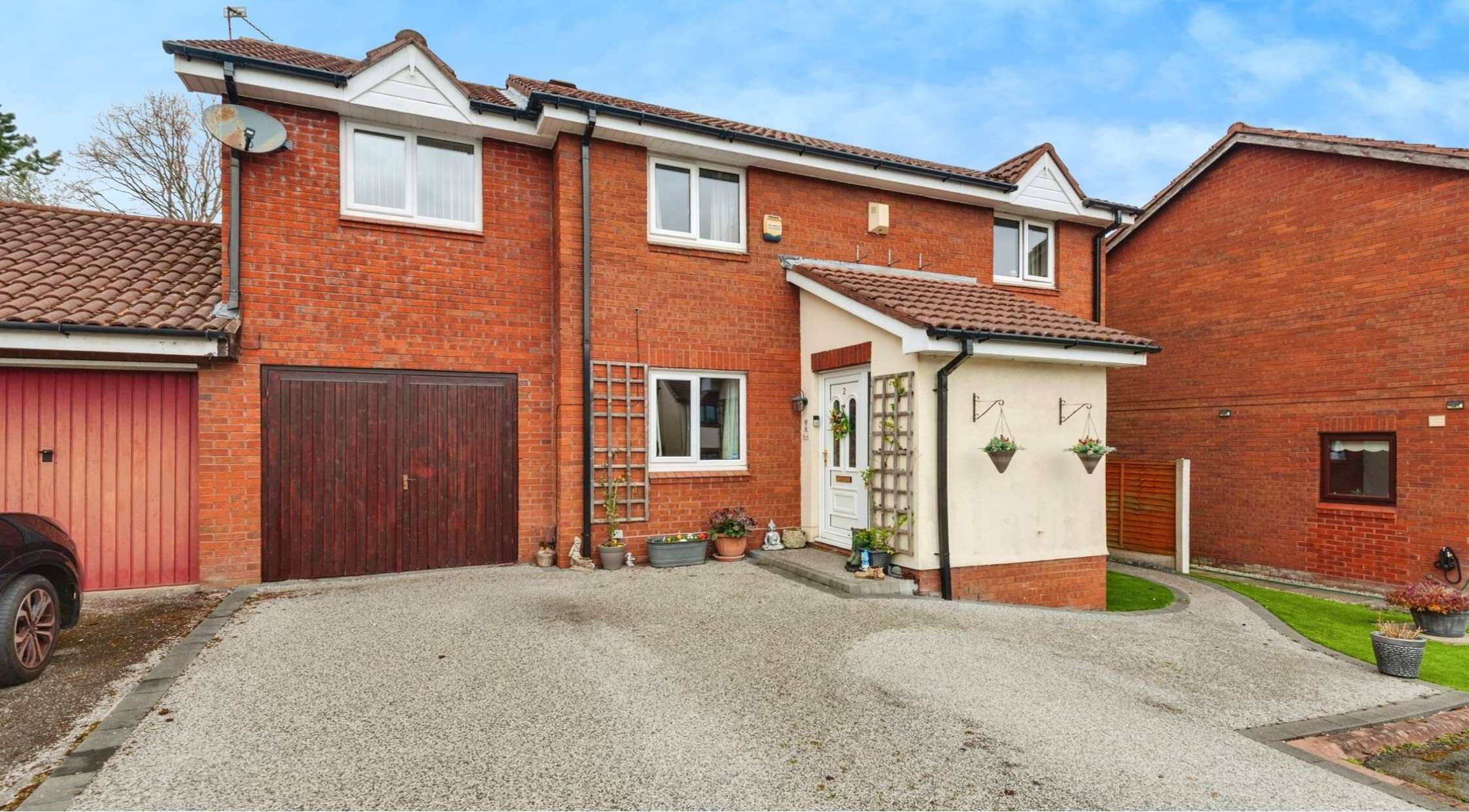
Bankside, Preston Brook Runcorn WA7 3LB