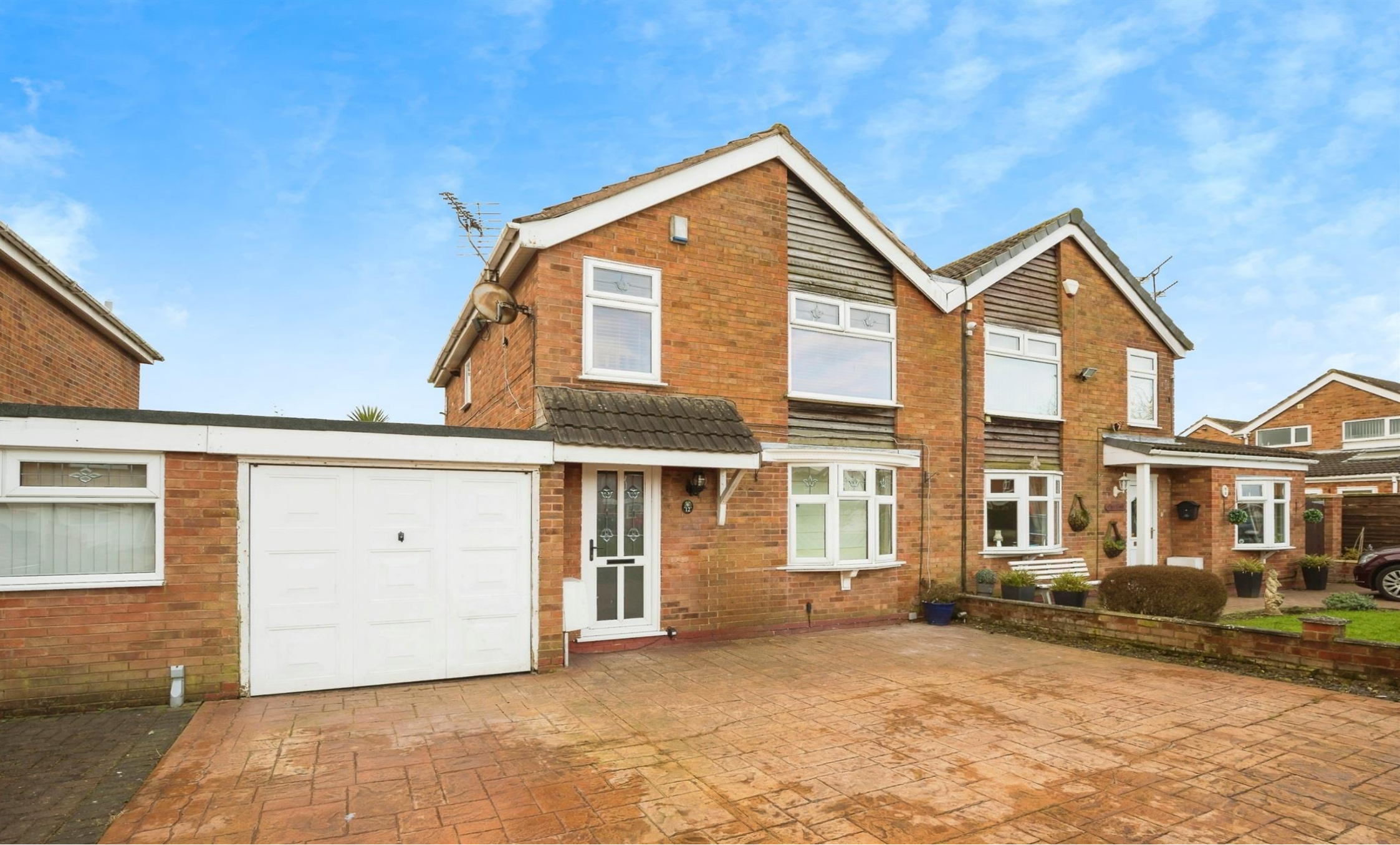
Alvanley View, Elton CH2 4QD