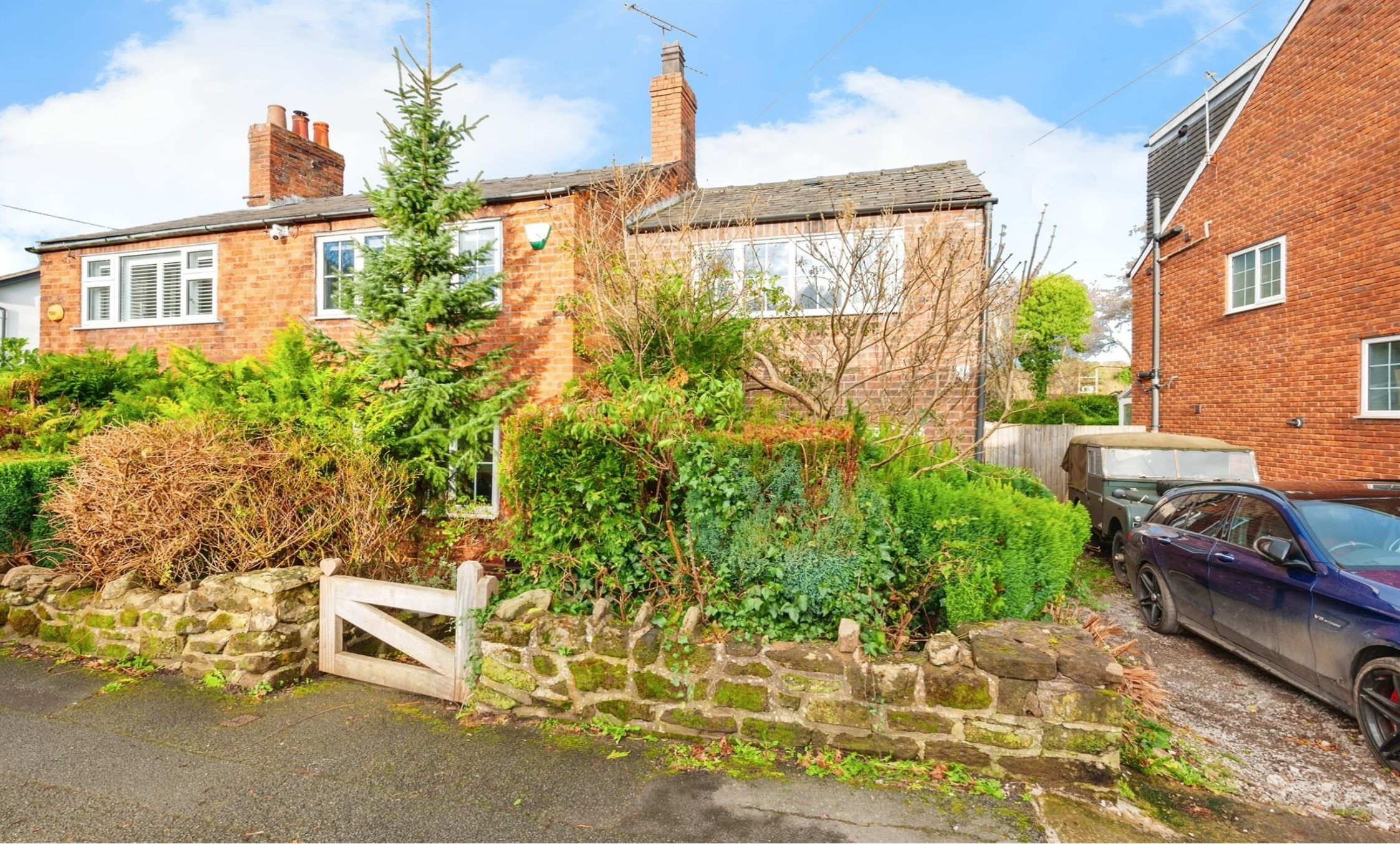
Rose Cottage, Ashton Road, Norley, Frodsham WA6 6NY