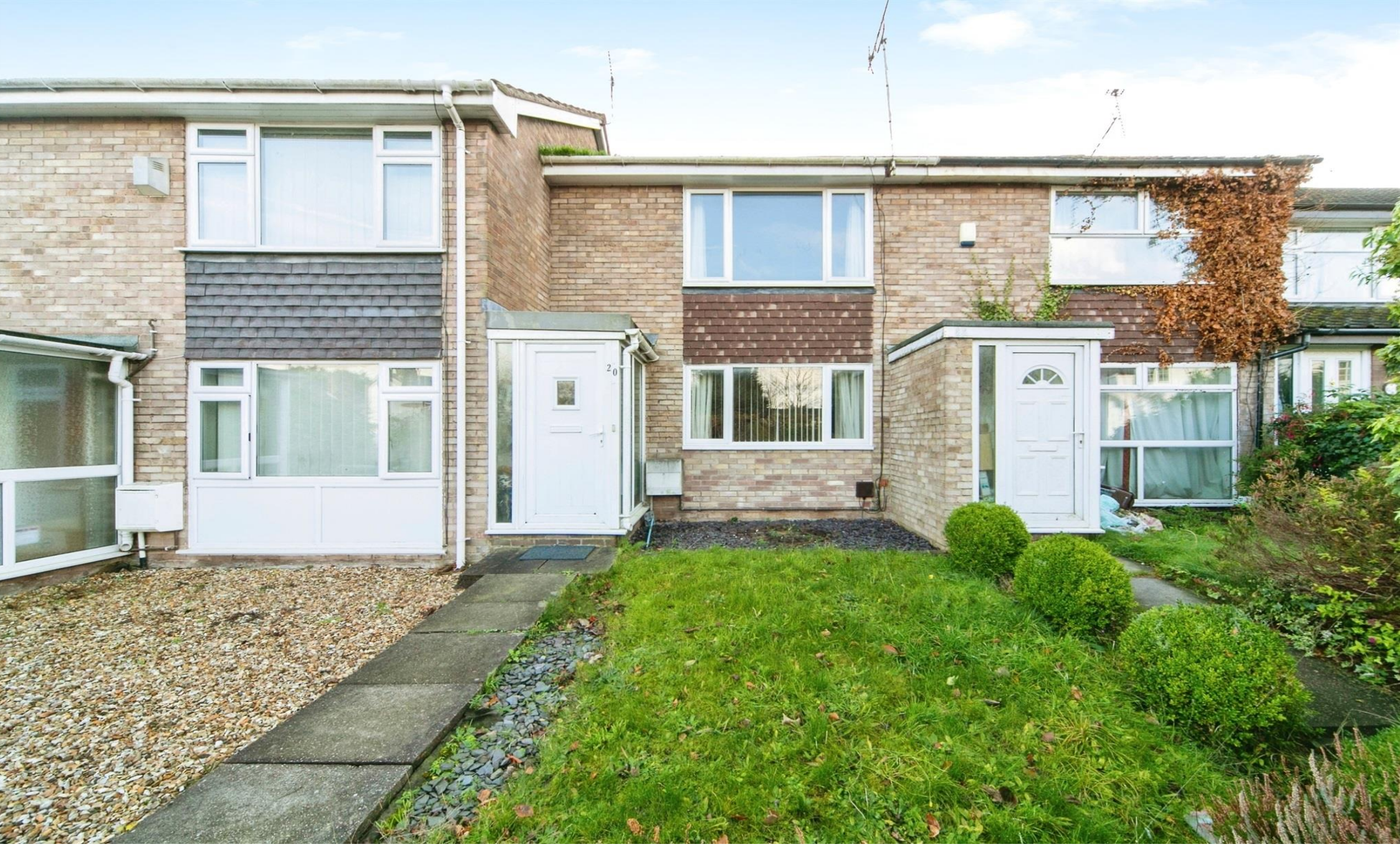
Dairy Bank, Elton CH2 4PF