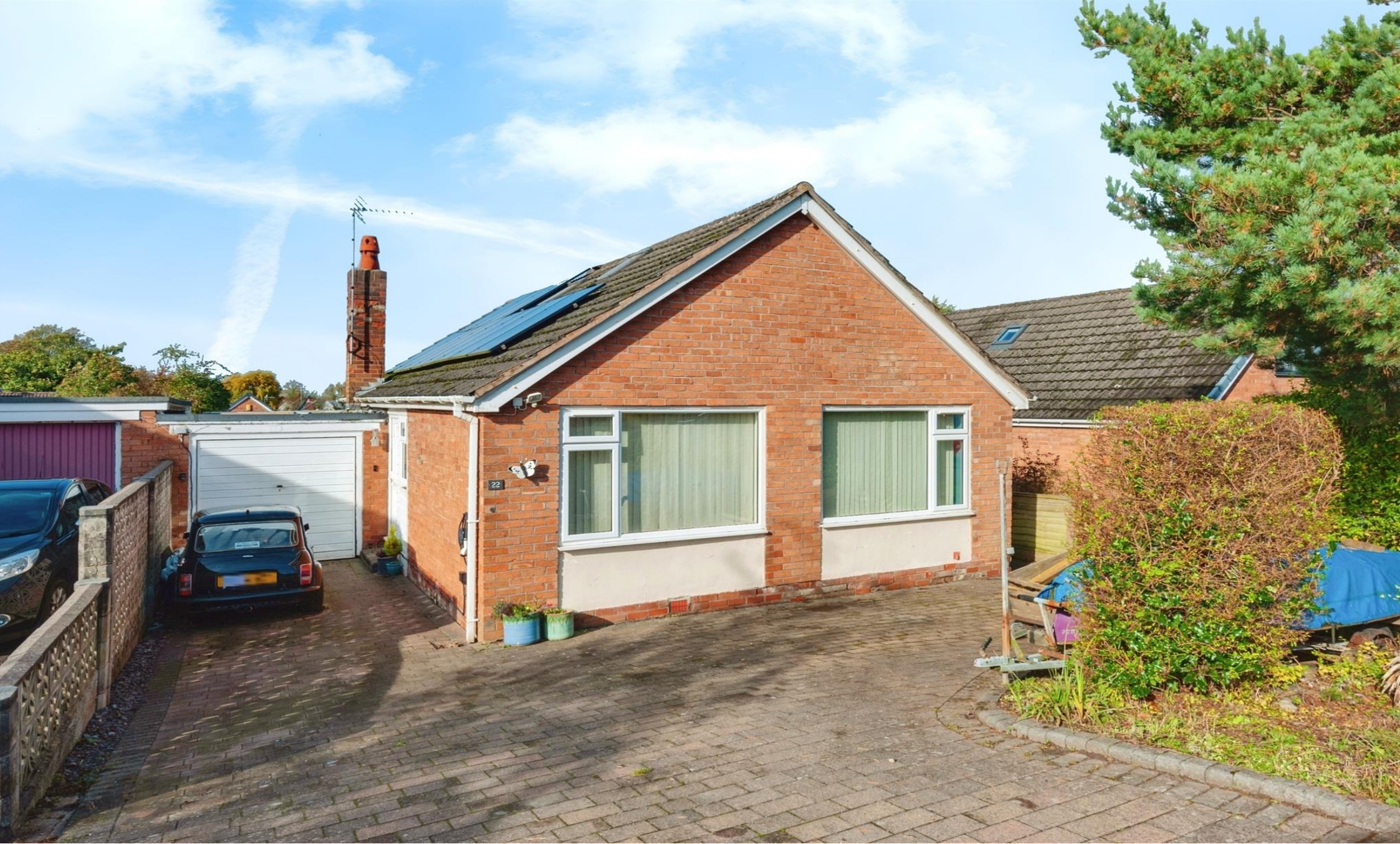
Coniston Drive, Frodsham WA6 7LR