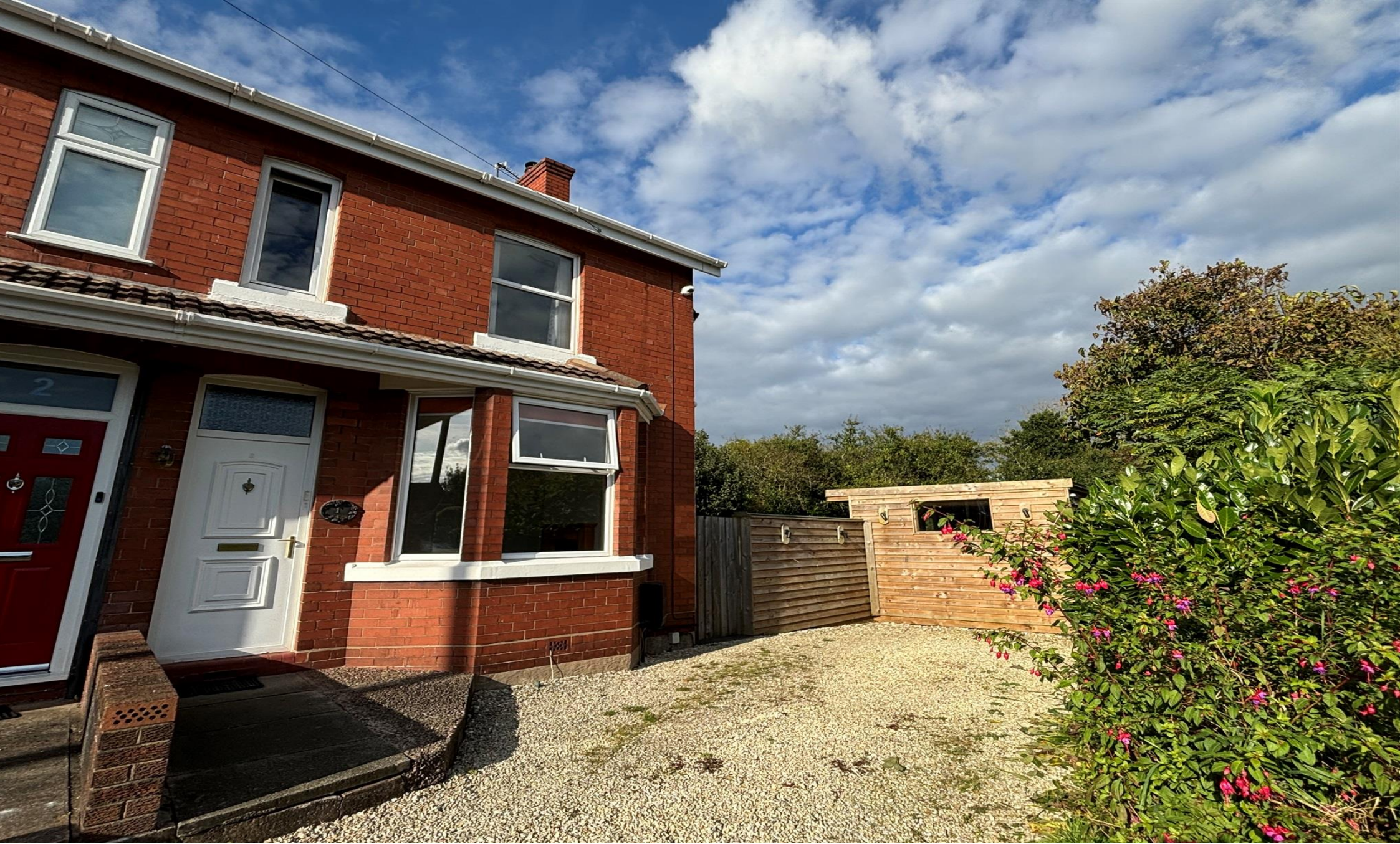
Rose Mount, Preston Brook, Runcorn WA7 3AS