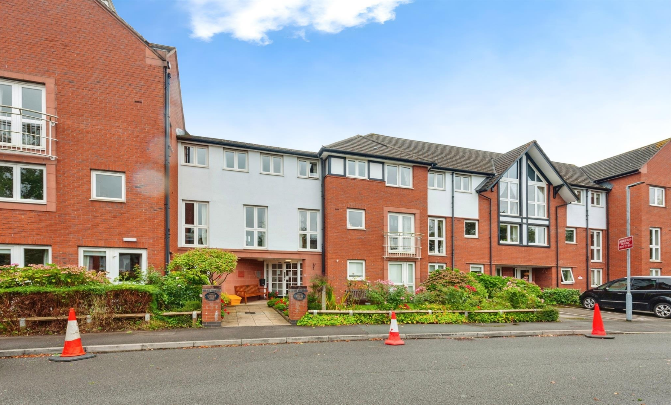
Ashley Court, Chapelfields, Frodsham WA6 7BG