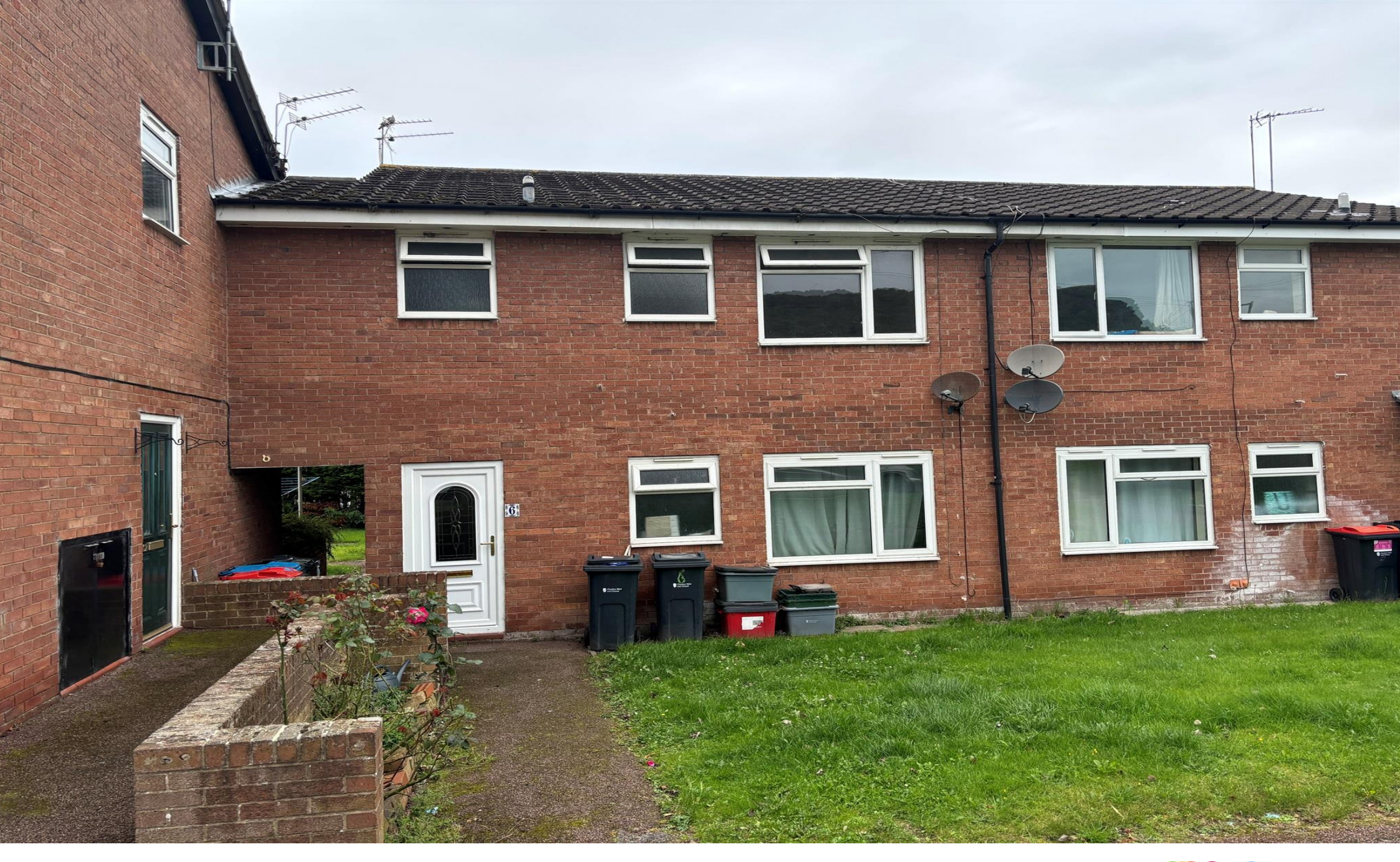
Springfield Avenue, Helsby WA6 0BZ