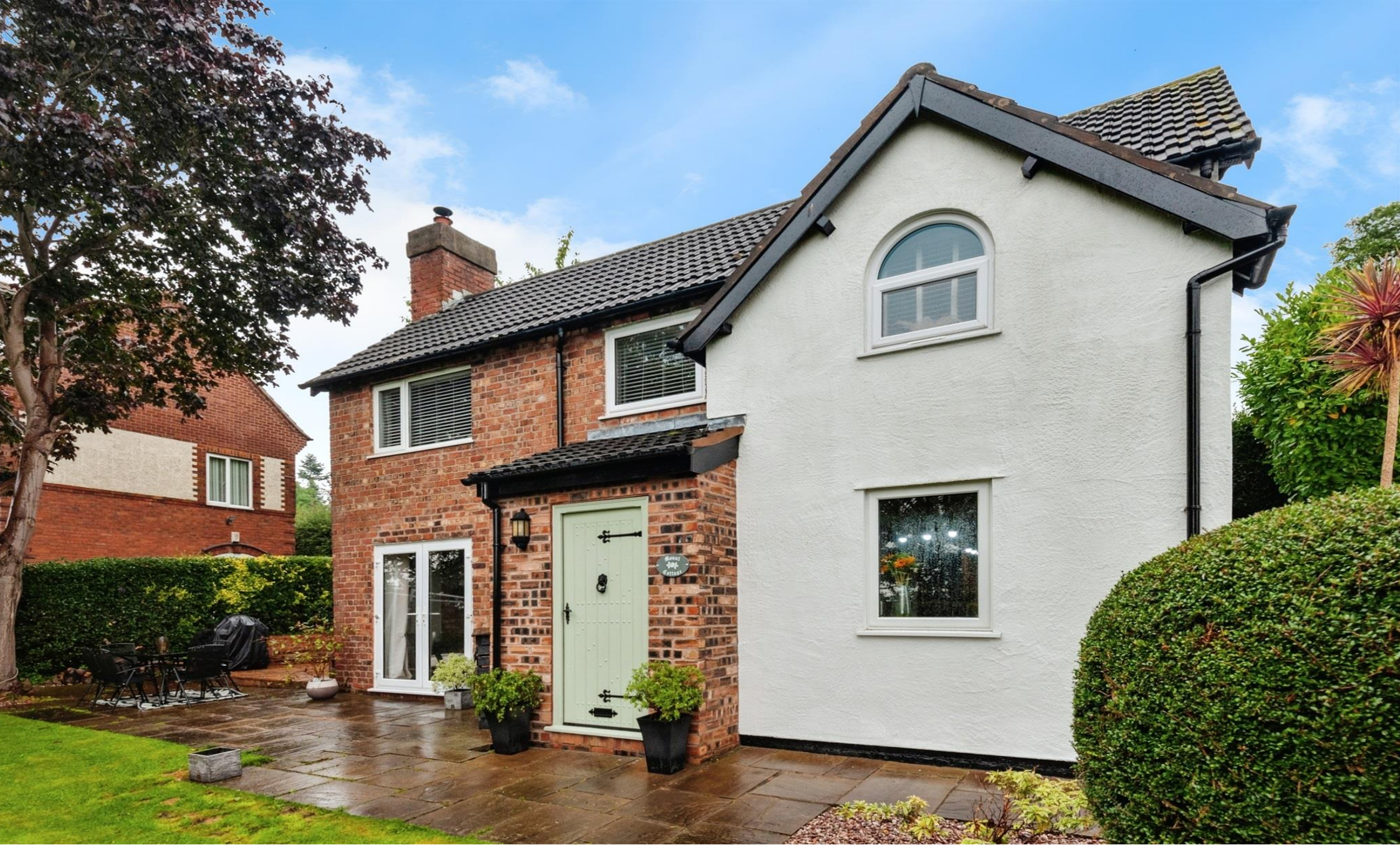
Mount Cottage, The Rock, Helsby WA6 9BQ