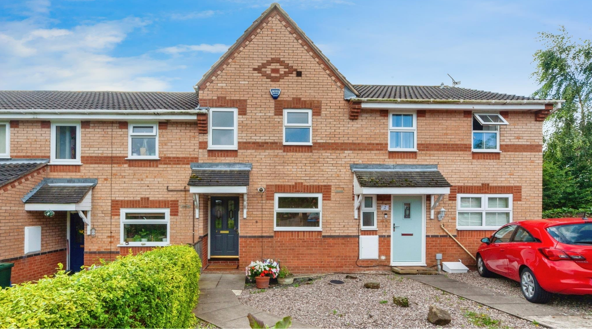
Sorbus Close, Elton CH2 4RW