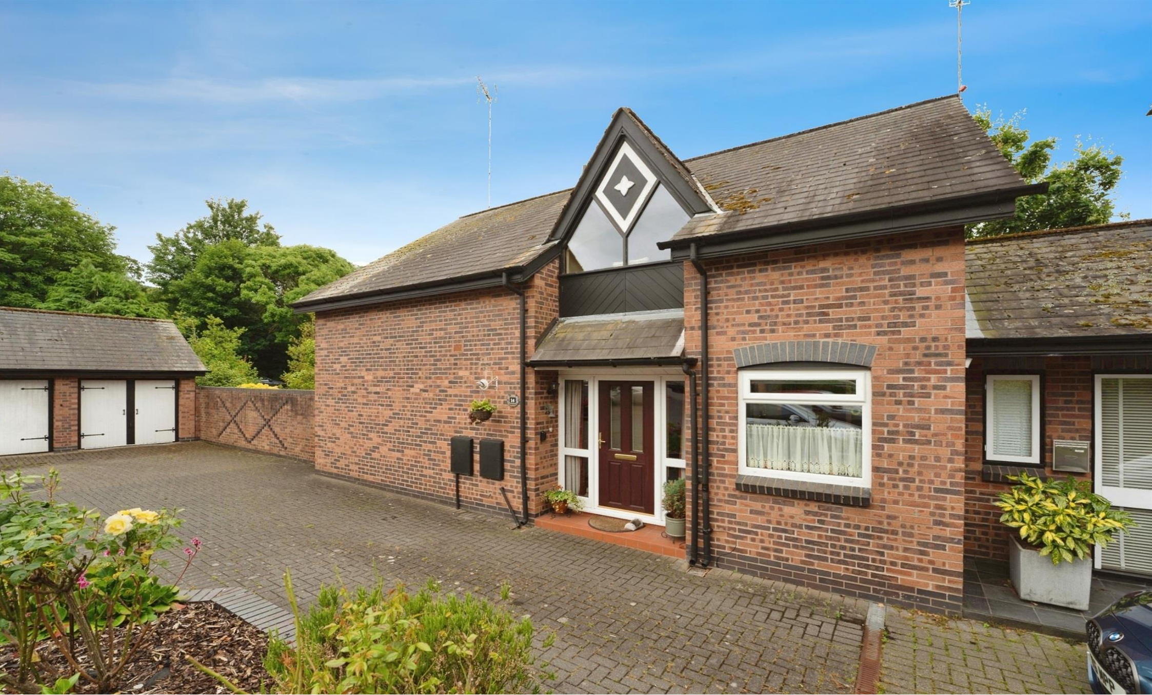
Millbank Court, Frodsham WA6 7AW