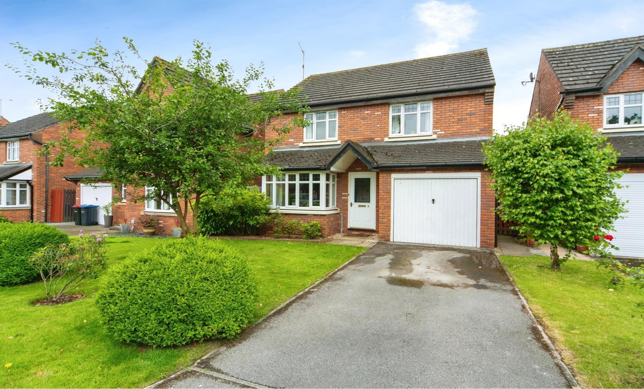
Cherry Tree Close, Elton CH2 4NH