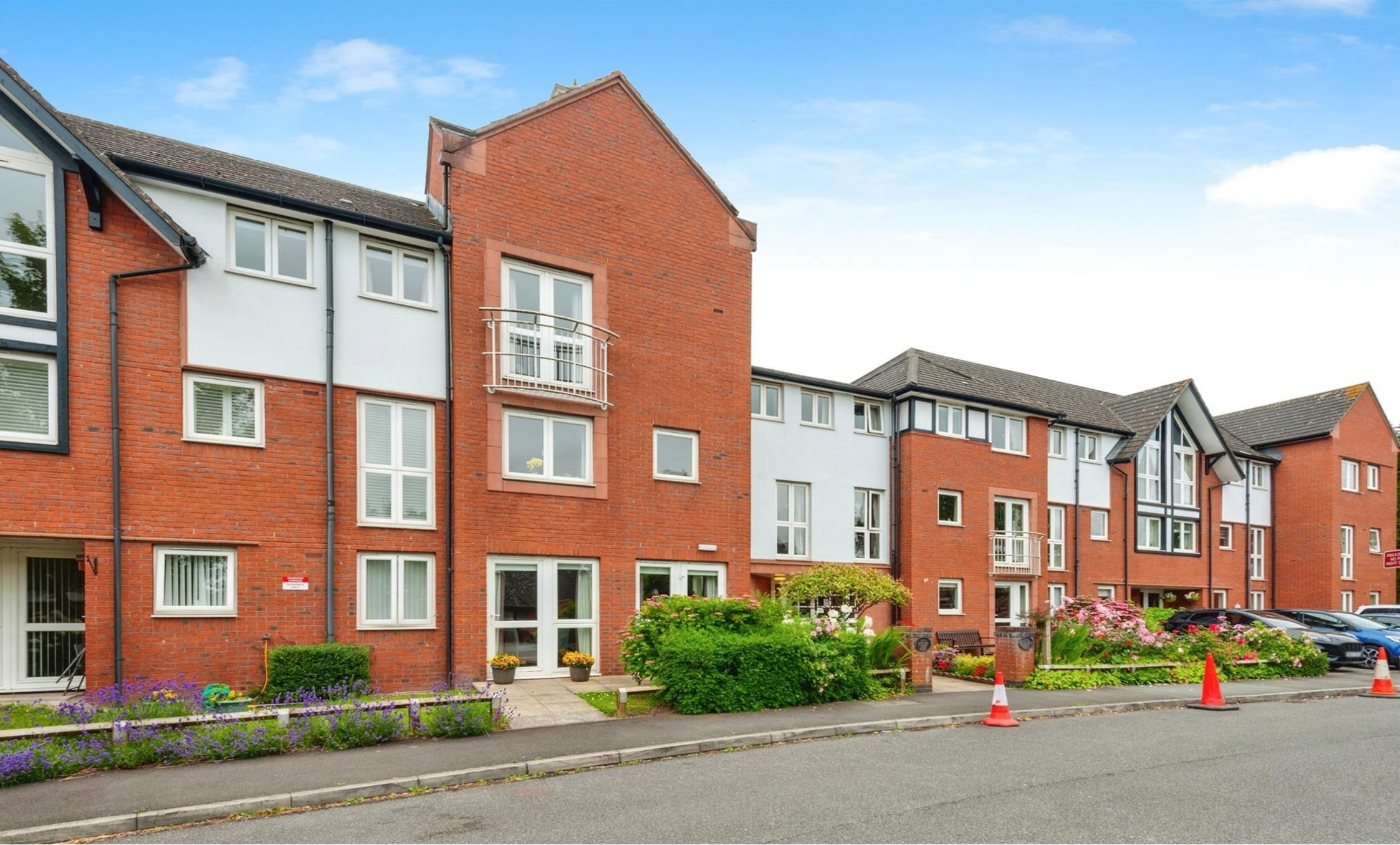
Ashley Court, Chapelfields, Frodsham WA6 7BG