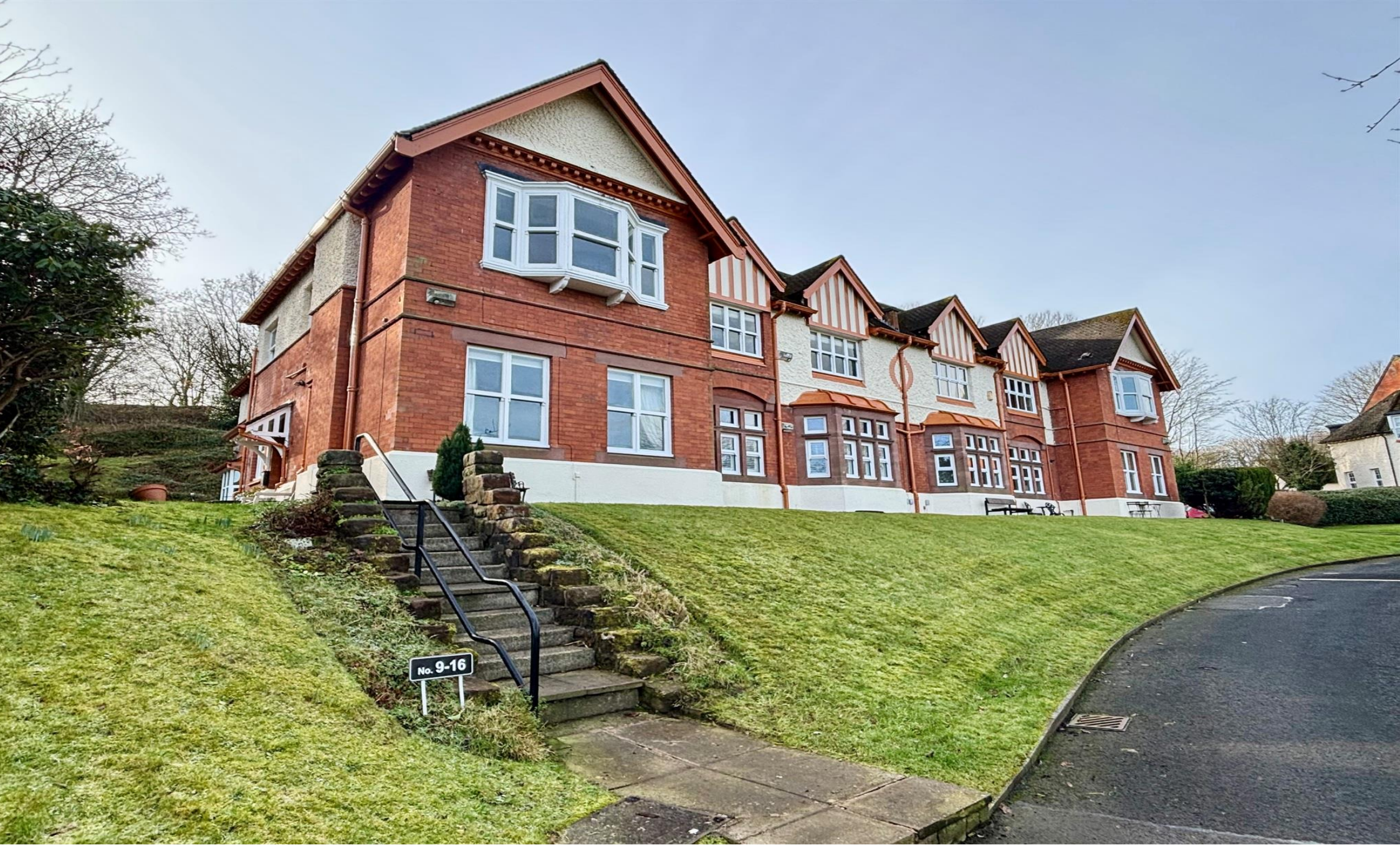
Kingsley Green, Frodsham WA6 6YA