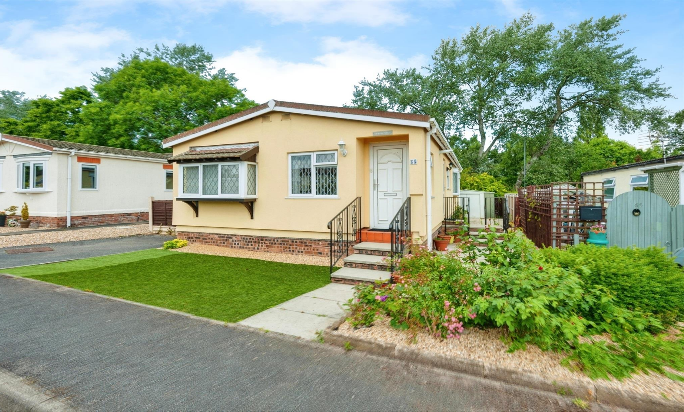
Orchard Park, Elton CH2 4NQ