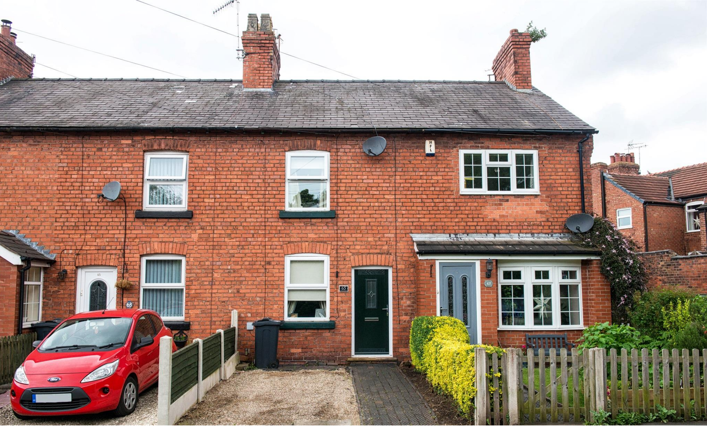
Robin Hood Lane, Helsby WA6 9NF