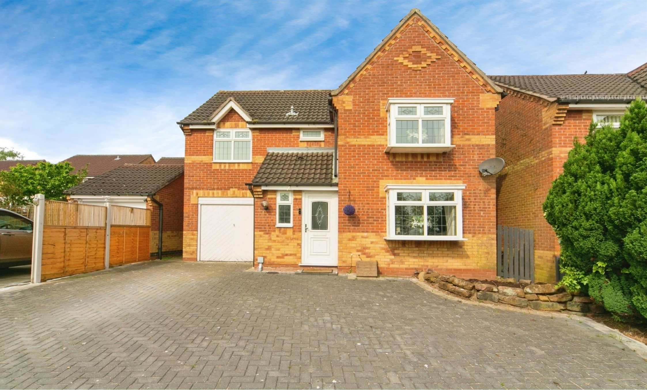
Mulberry Close, Elton CH2 4RN