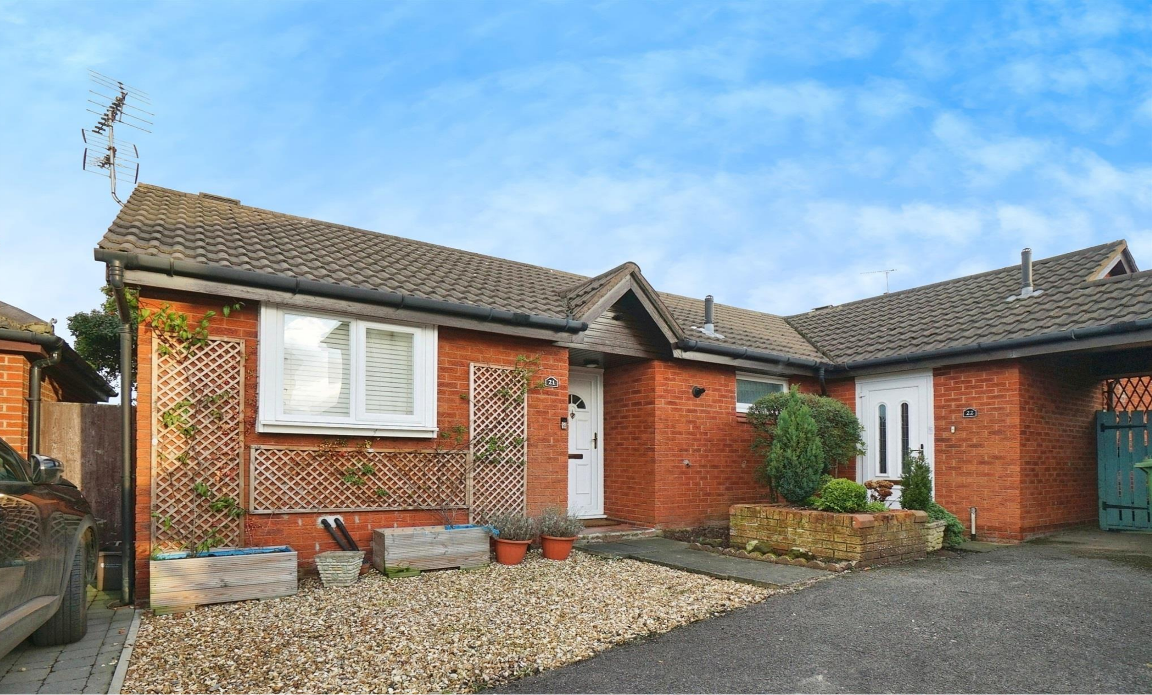
Holly Court, Helsby WA6 0PH