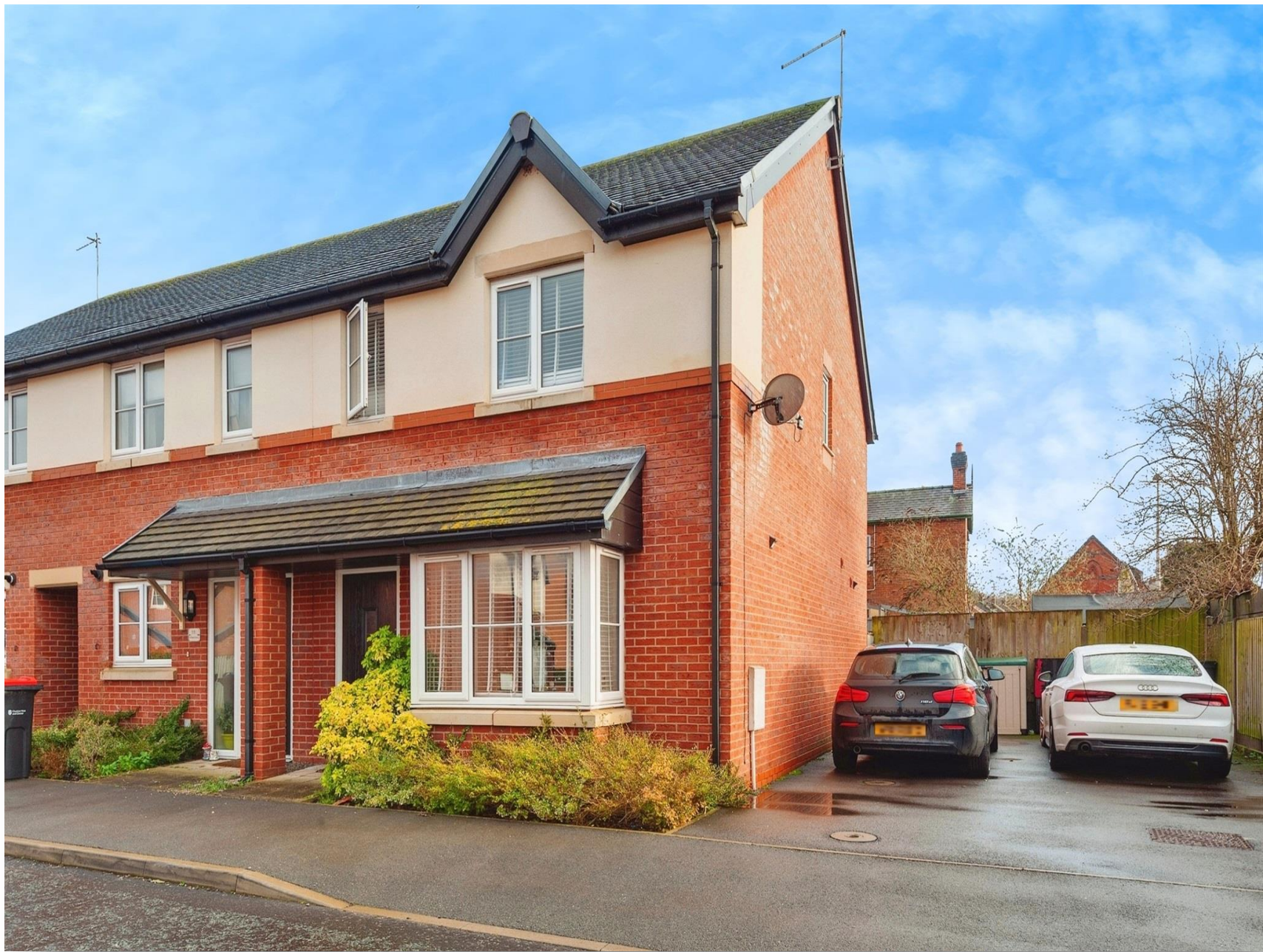
Barlow Drive, Helsby WA6 0AA