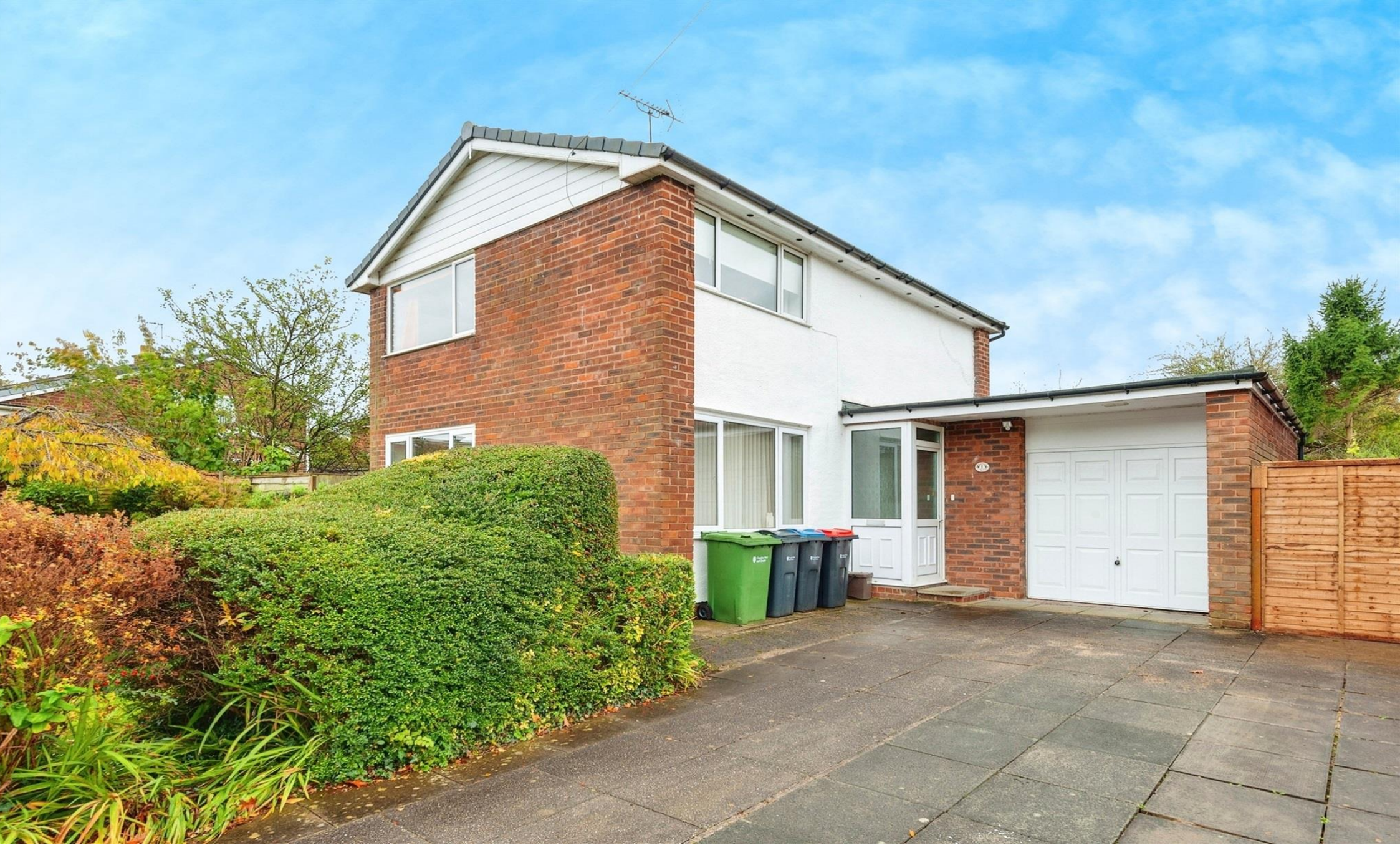
Denbigh Close, Helsby WA6 0ED