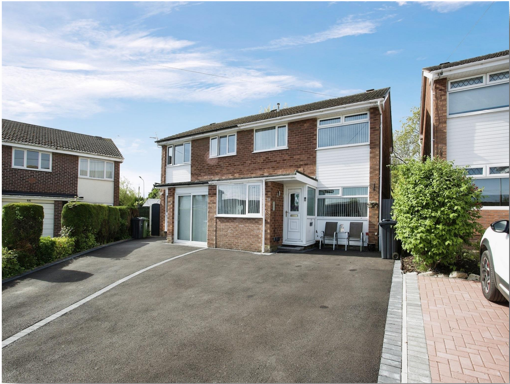
Weaver Road, Frodsham WA6 7HP