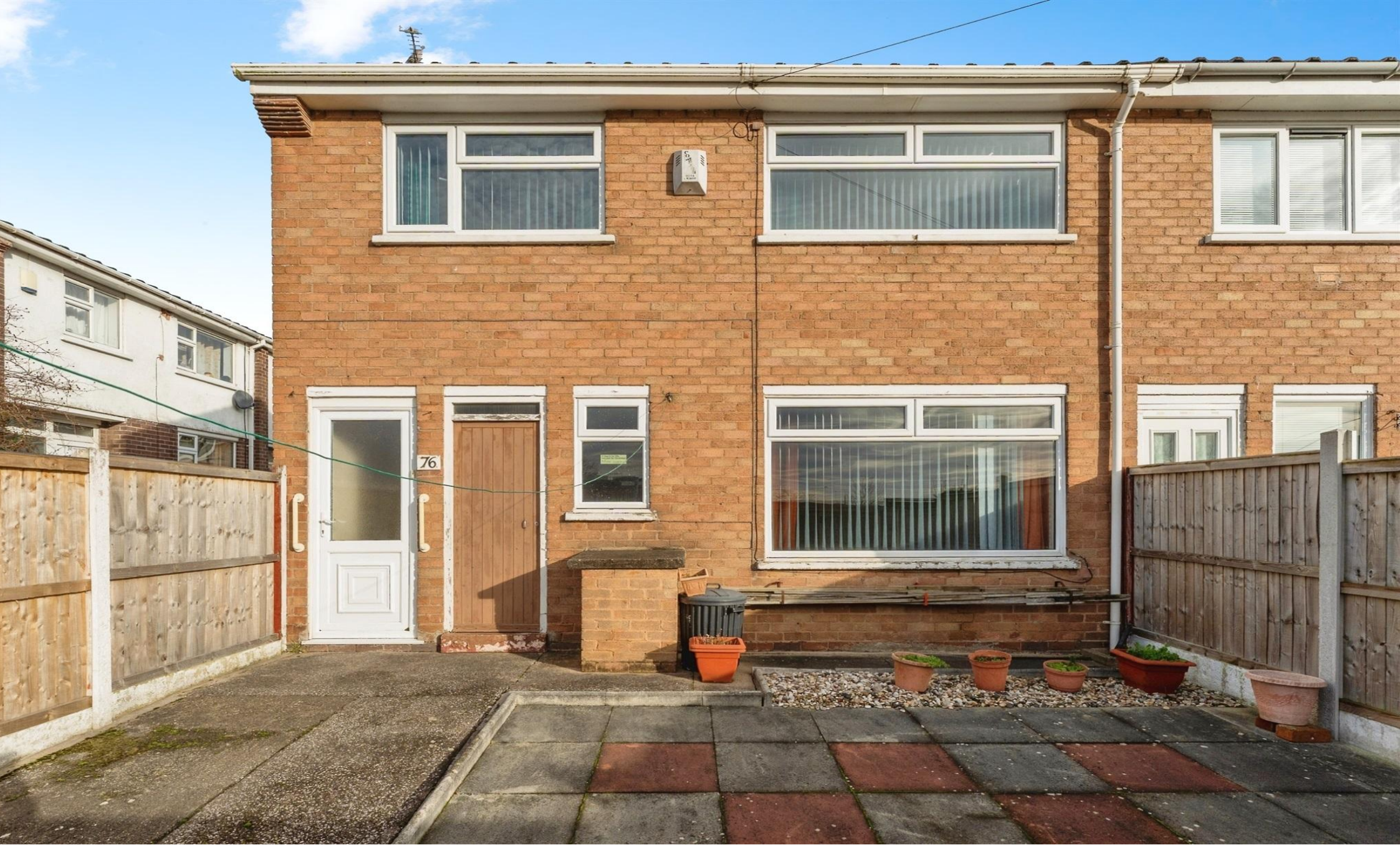
Cairns Crescent, Blacon Chester CH1 5JF