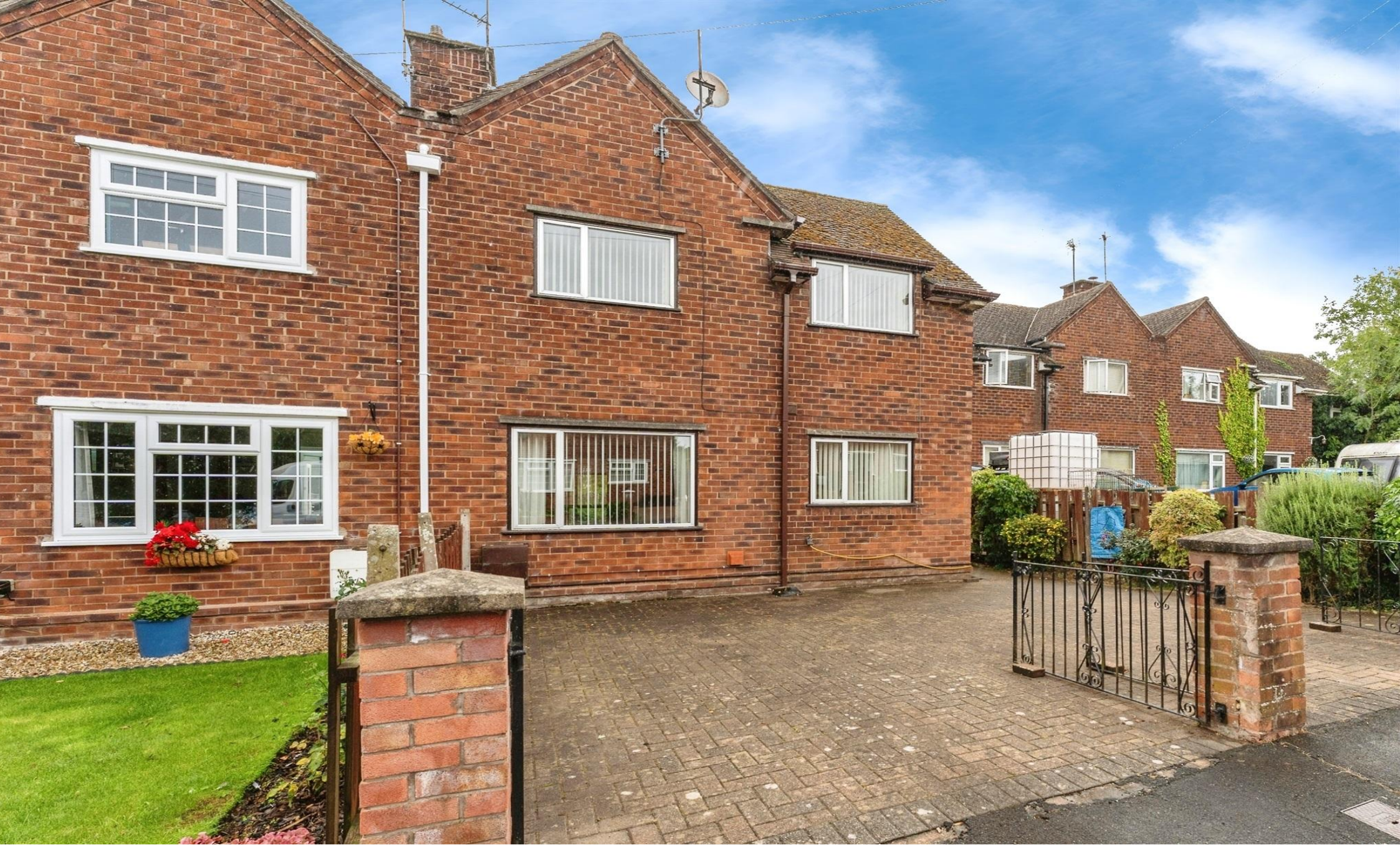
Crompton Close, Higher Kinnerton CHESTER CH4 9AT