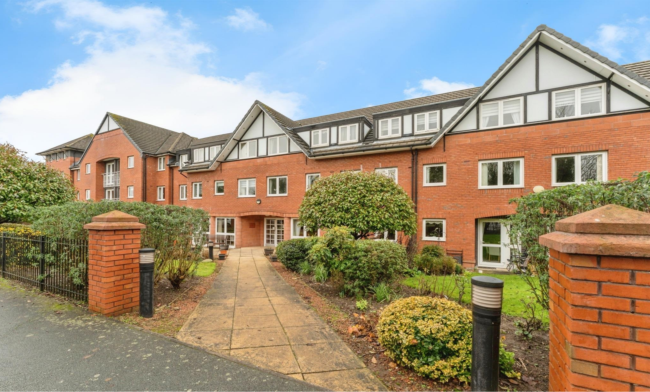
Arkle Court, Vicars Cross Chester CH3 5PL