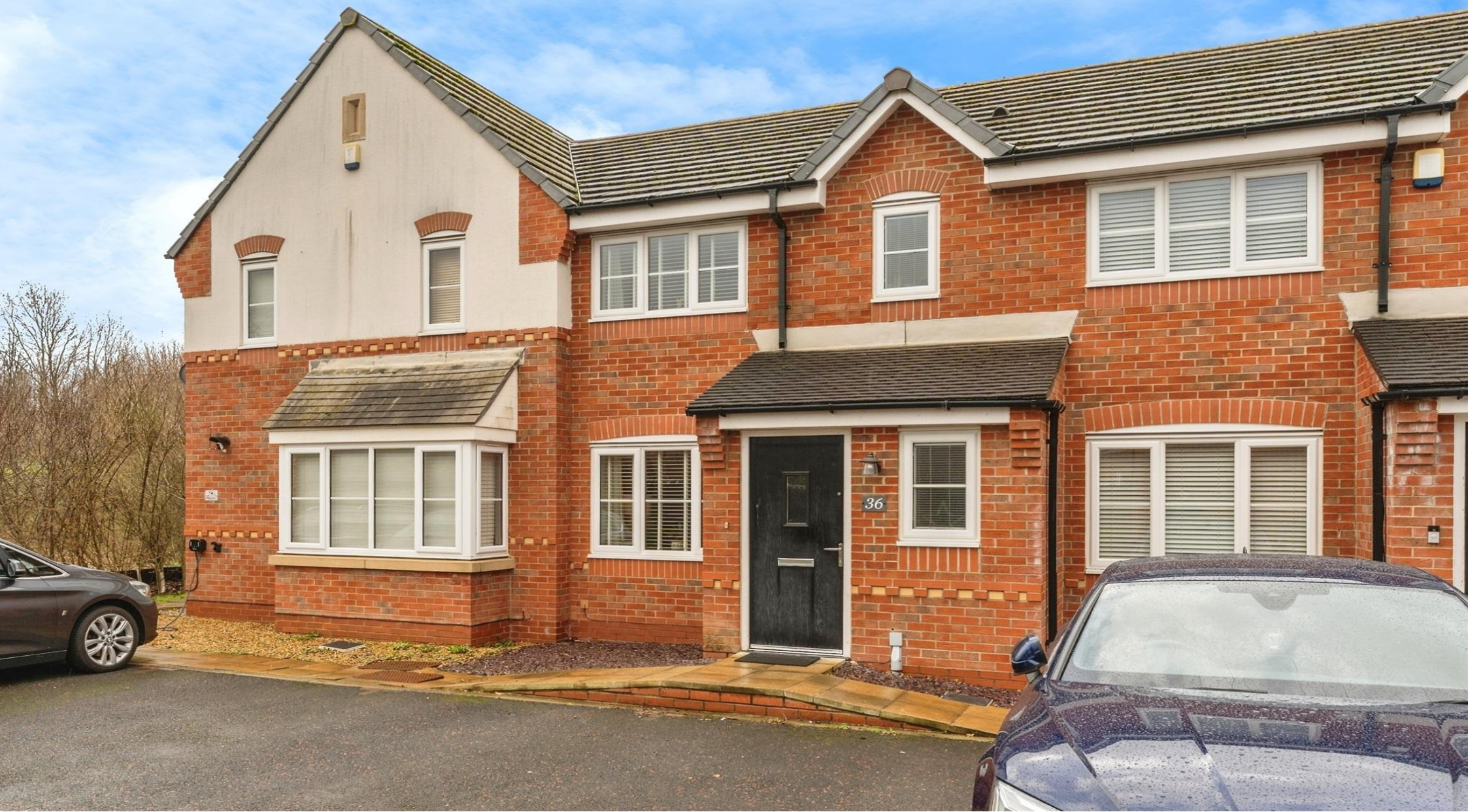
Whitley Drive, Broughton Chester CH4 0TL

Not for marketing purposes INTERNAL USE ONLY