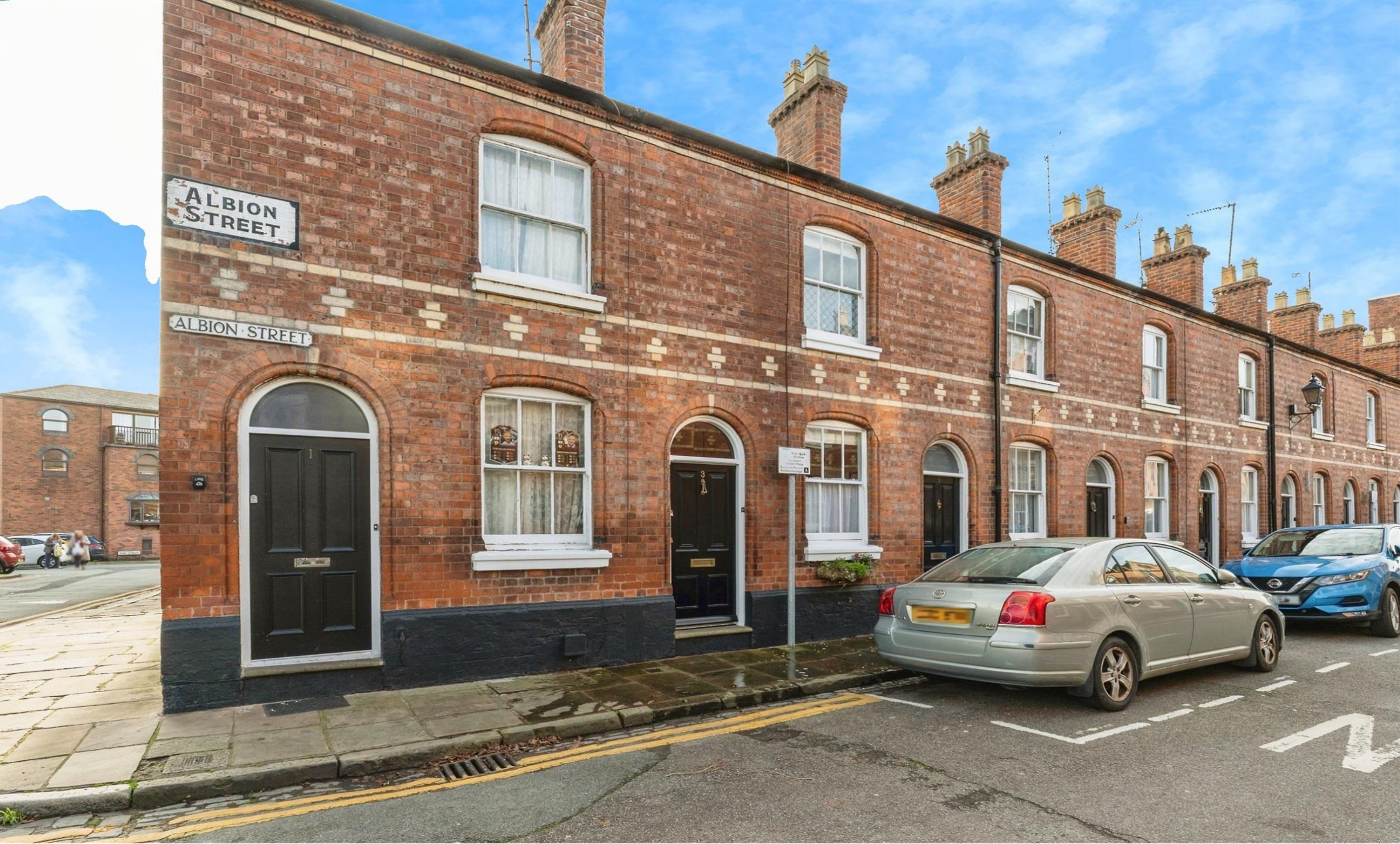
Albion Street, Chester CH1 1RQ