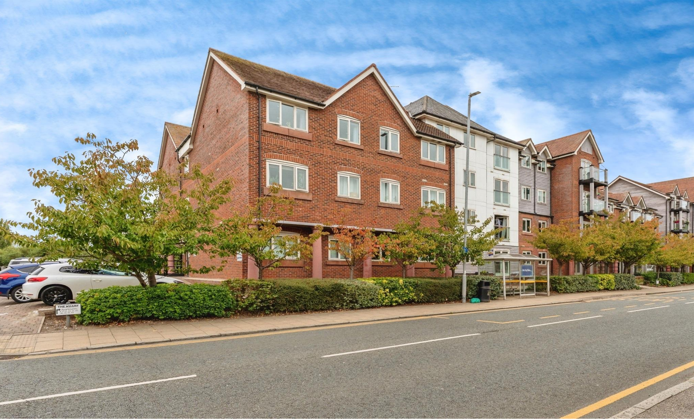
The Wharf New Crane Street, Chester CH1 4HZ