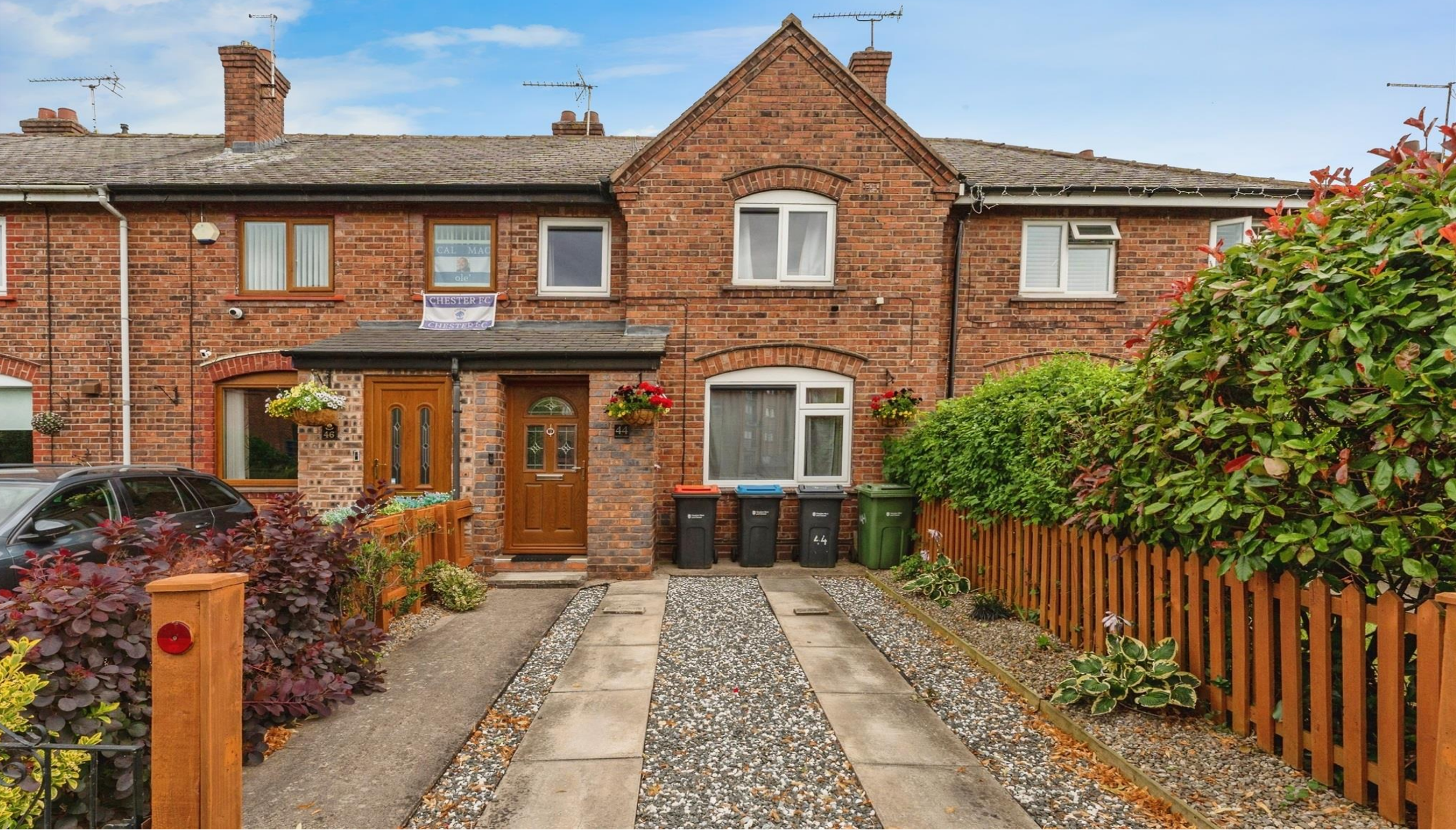
Hoole Lane, Chester CH2 3DS