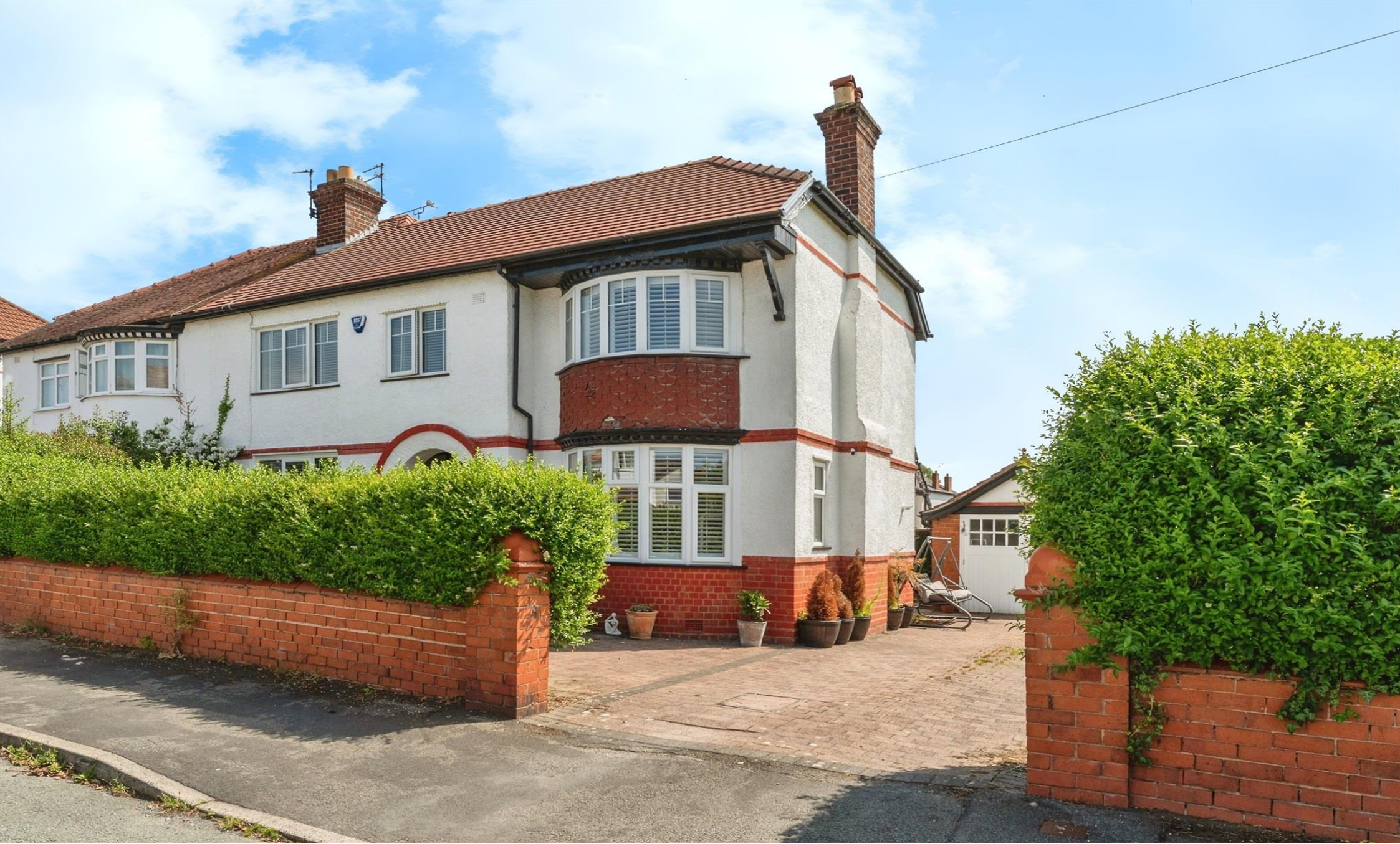
Kings Crescent East, Chester CH3 5TH