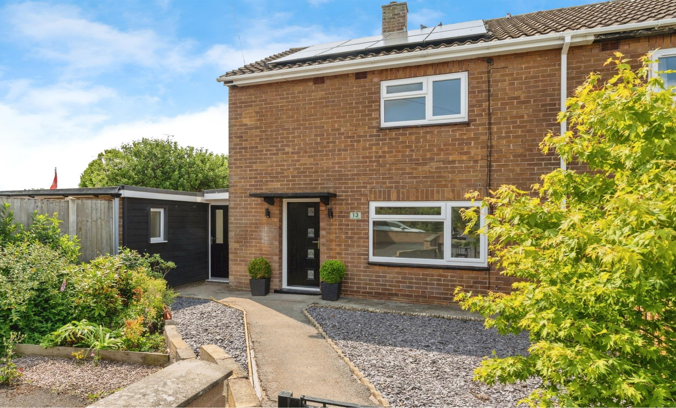
Fieldway, Saughall, Chester CH1 6DX