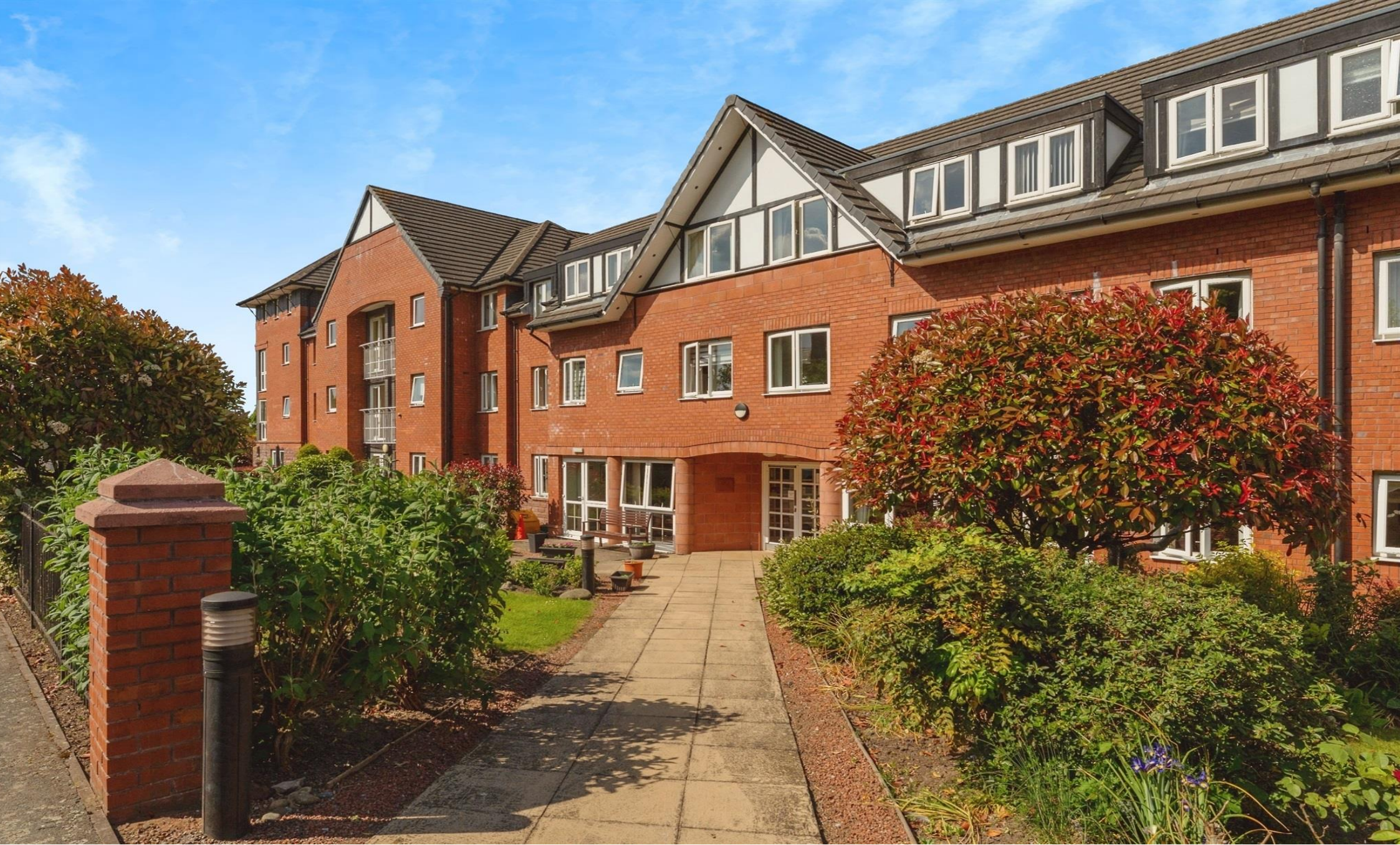
Arkle Court, Vicars Cross, Chester CH3 5PL