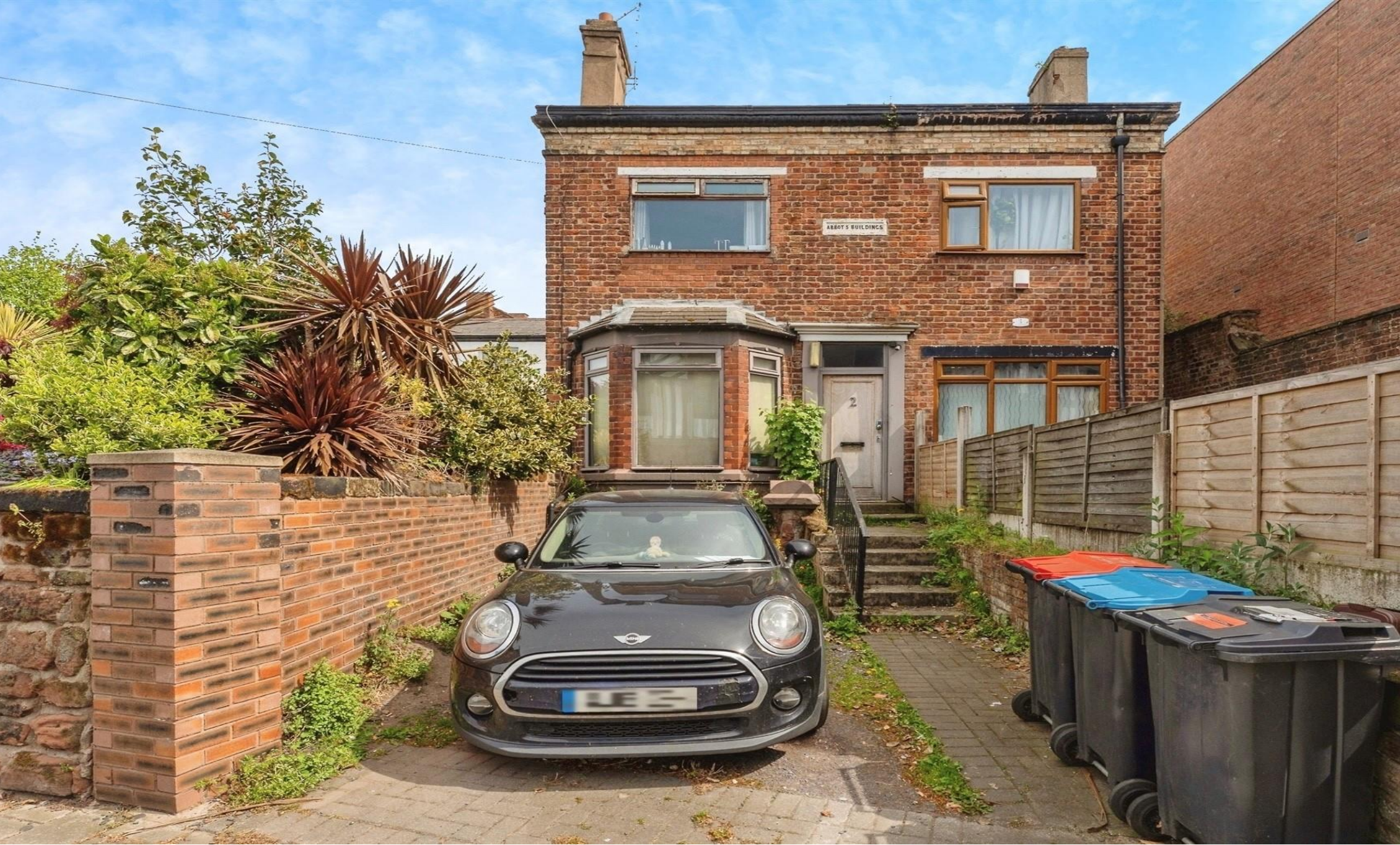
Abbot's Building, Liverpool Road, Chester CH2 1AH