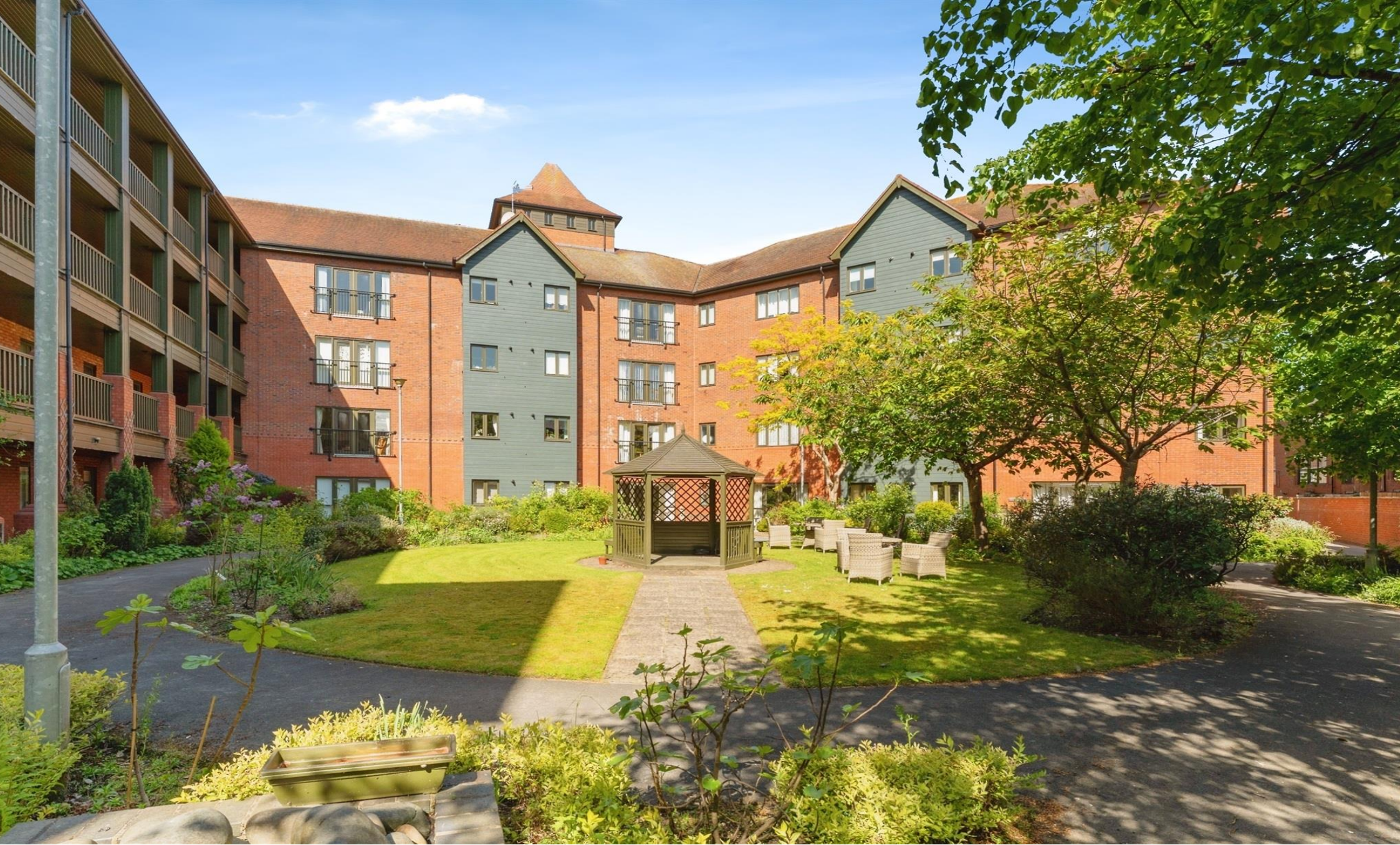
Bowling Green Court, Brook Street, Chester CH1 3DP