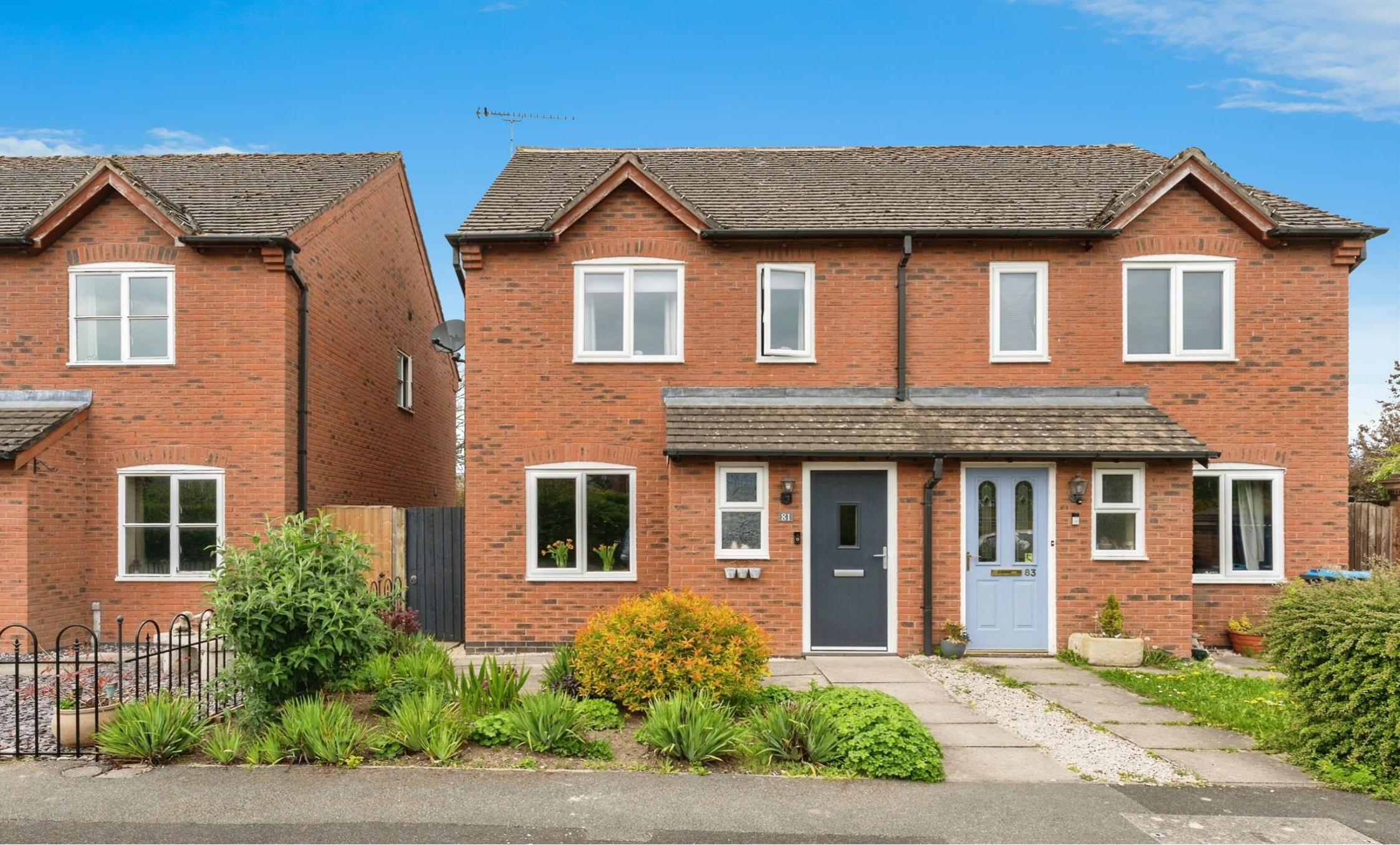
Rean Meadow, Tattenhall, Chester CH3 9PU