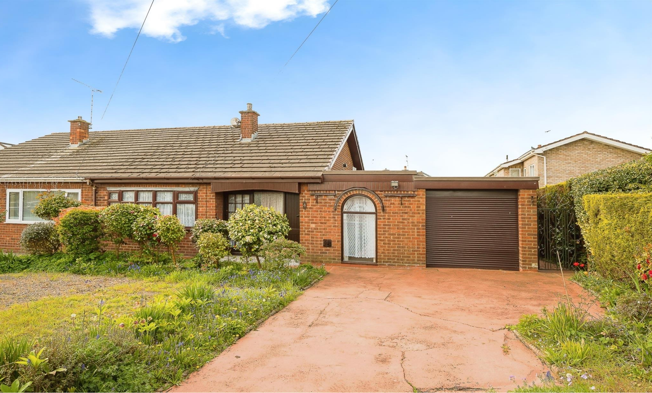
Kennedy Close, Chester CH2 2PL