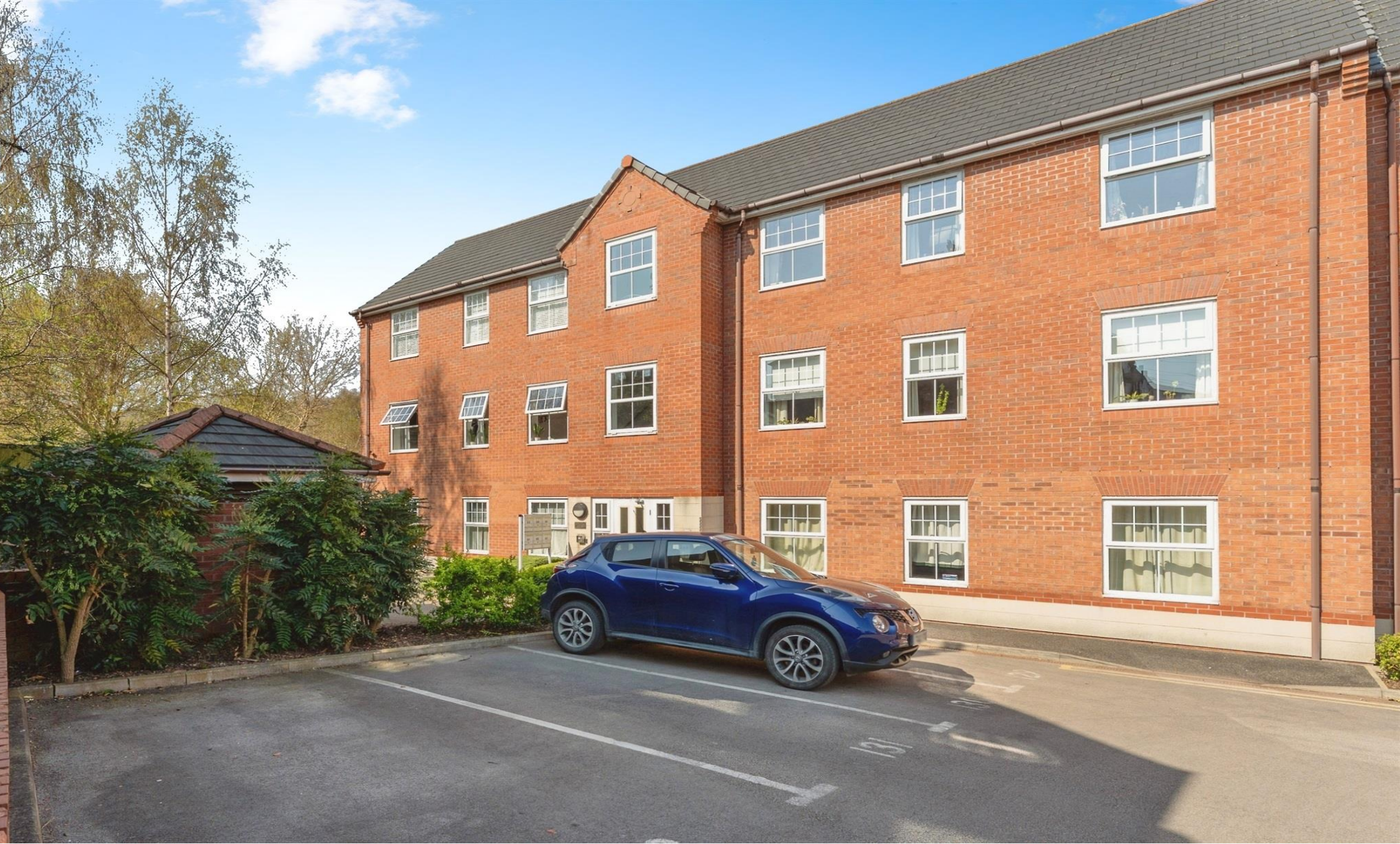
Black Diamond Park, Chester CH1 3EW