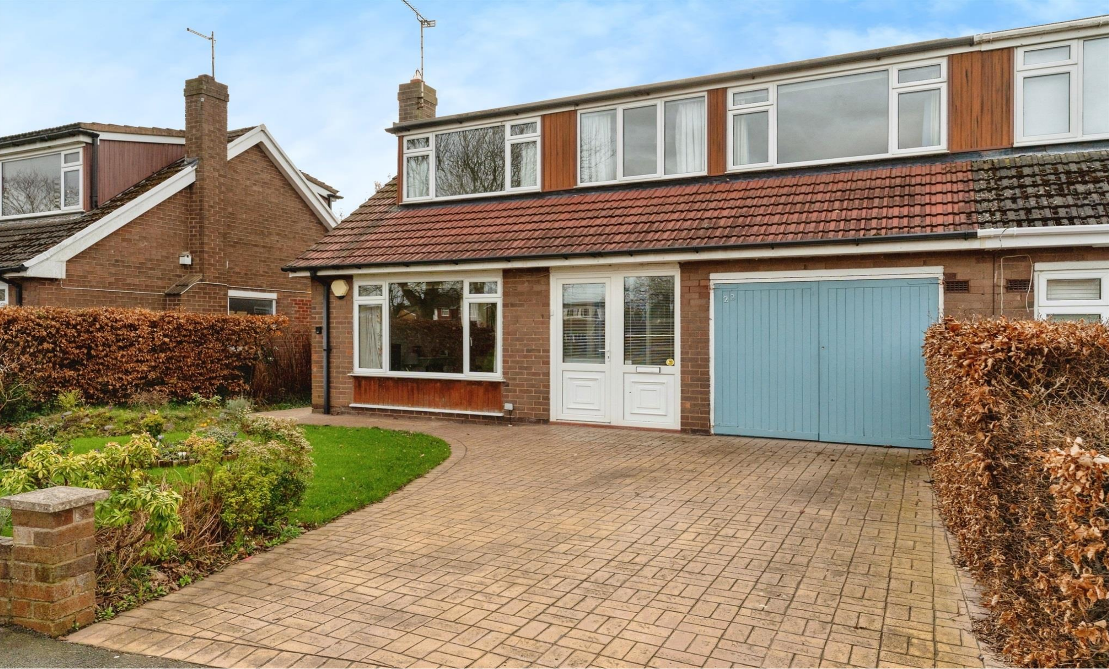
Gatesheath Drive, Upton, Chester CH2 1QT