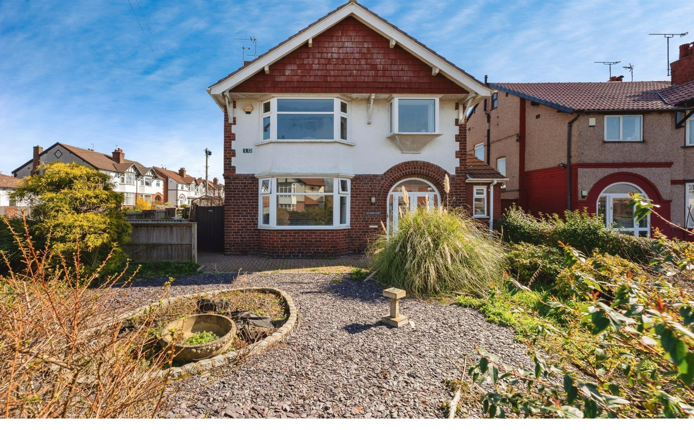
Green Lane, Vicars Cross, Chester CH3 5LA