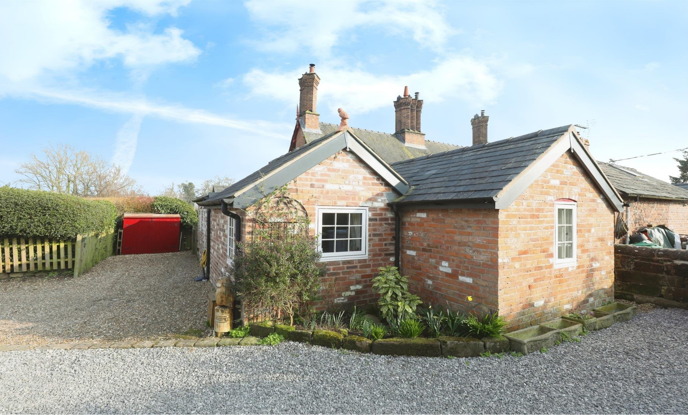
Bank Cottage, Stone House Lane, Peckforton, Tarporley CW6 9TN