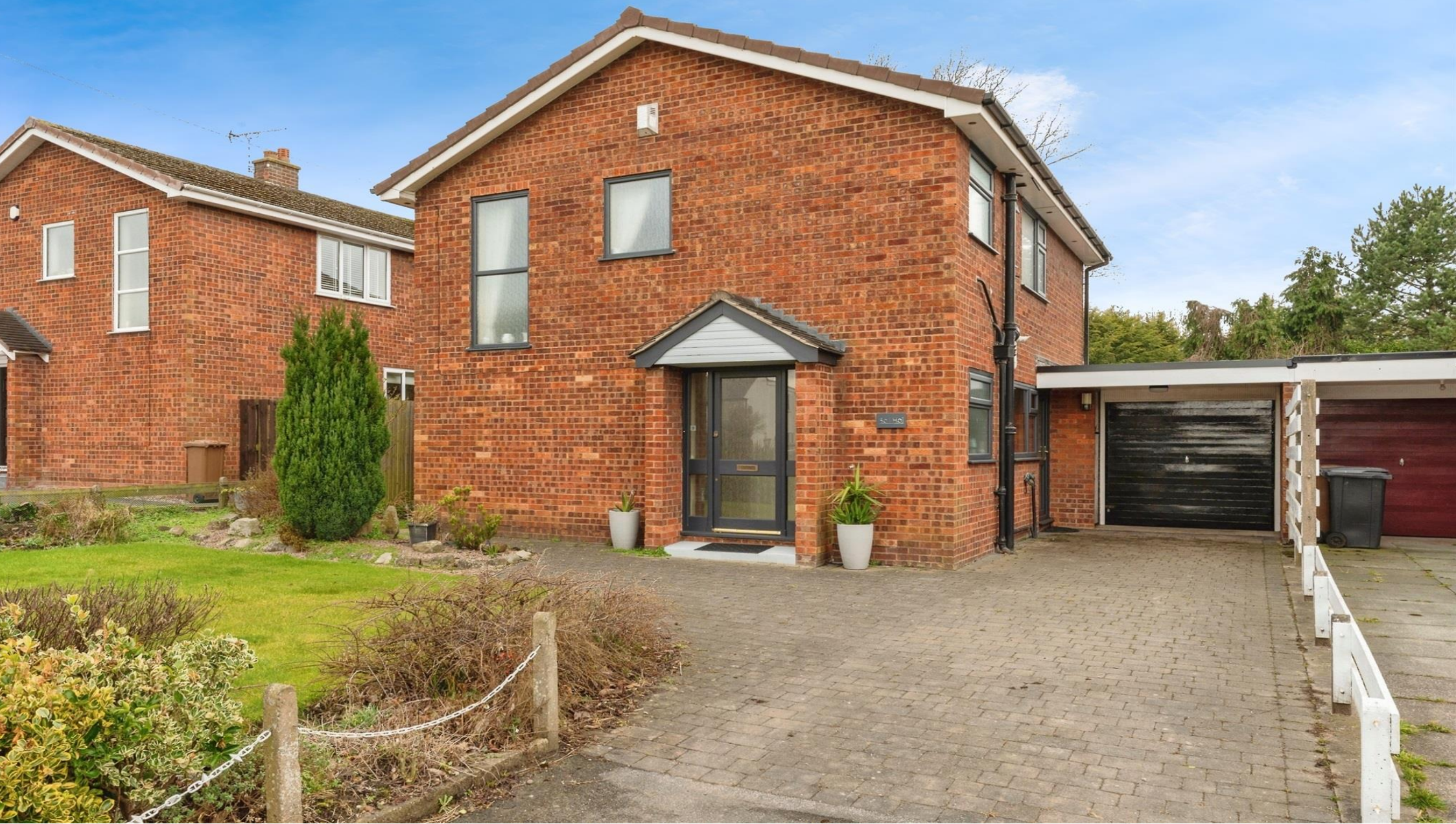
Bali Hai, Bretton Lane, Bretton, Chester CH4 0DW