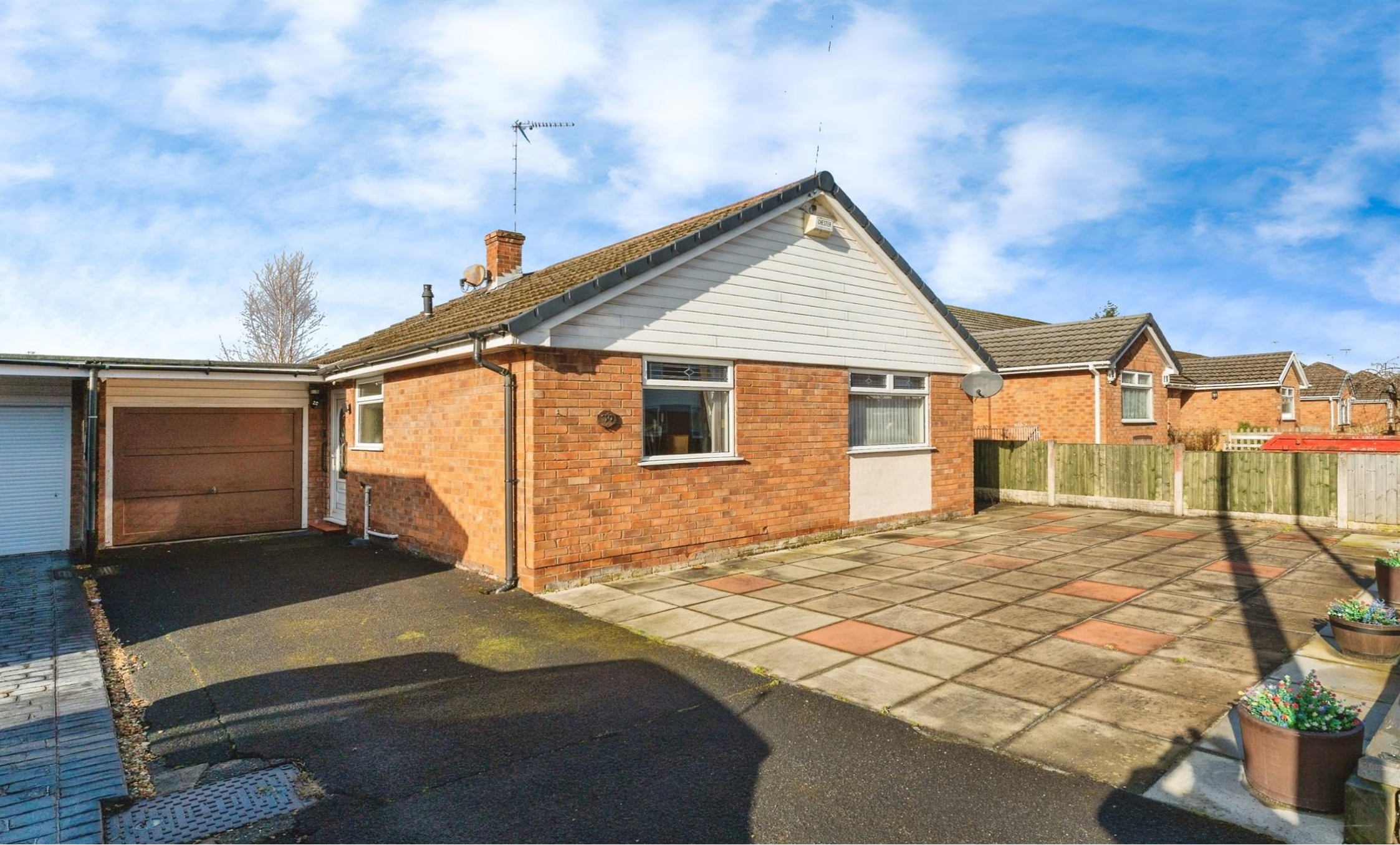
Sutton Drive, Chester CH2 2HW