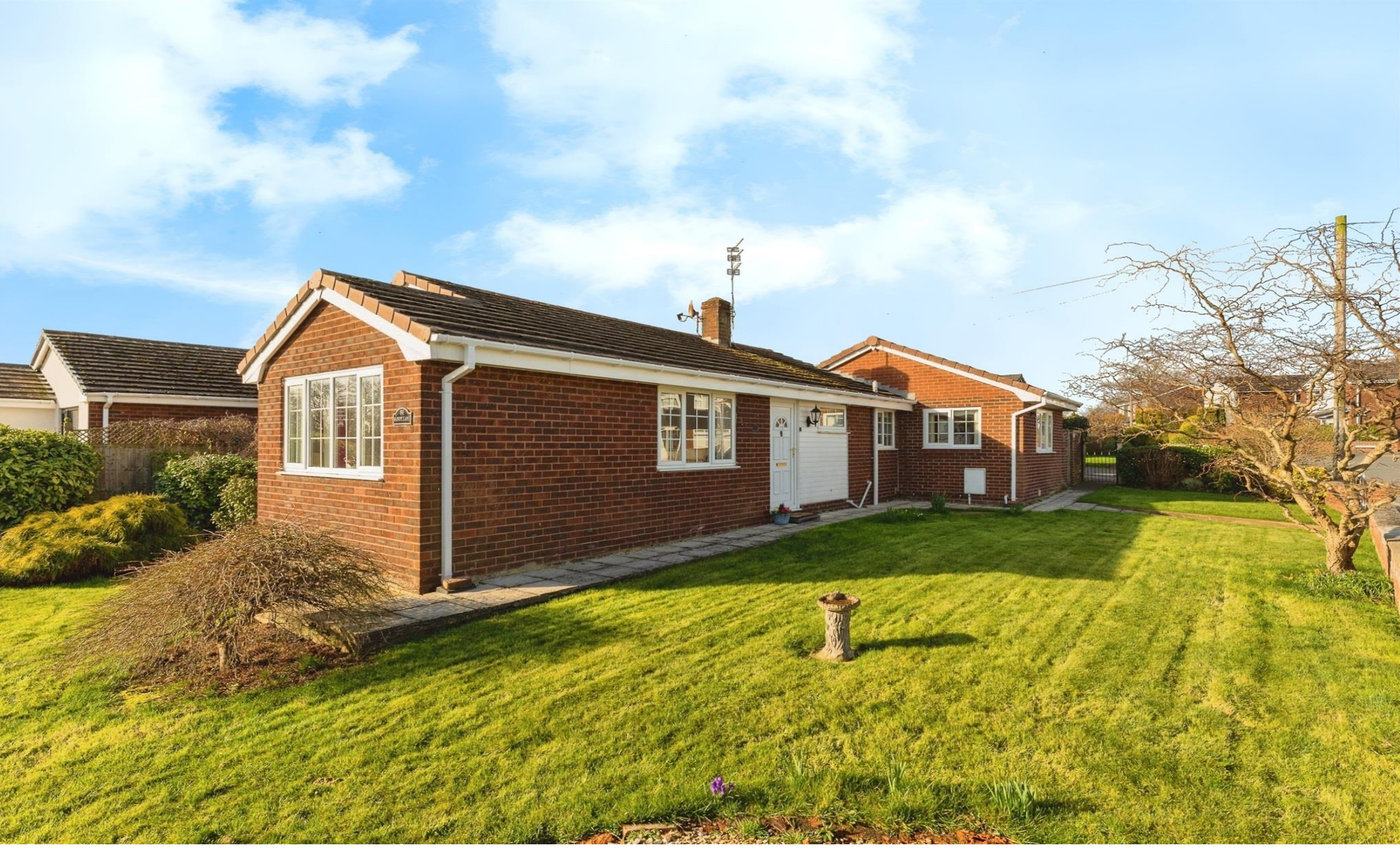
Sandy Lane, Higher Kinnerton, Chester CH4 9BS