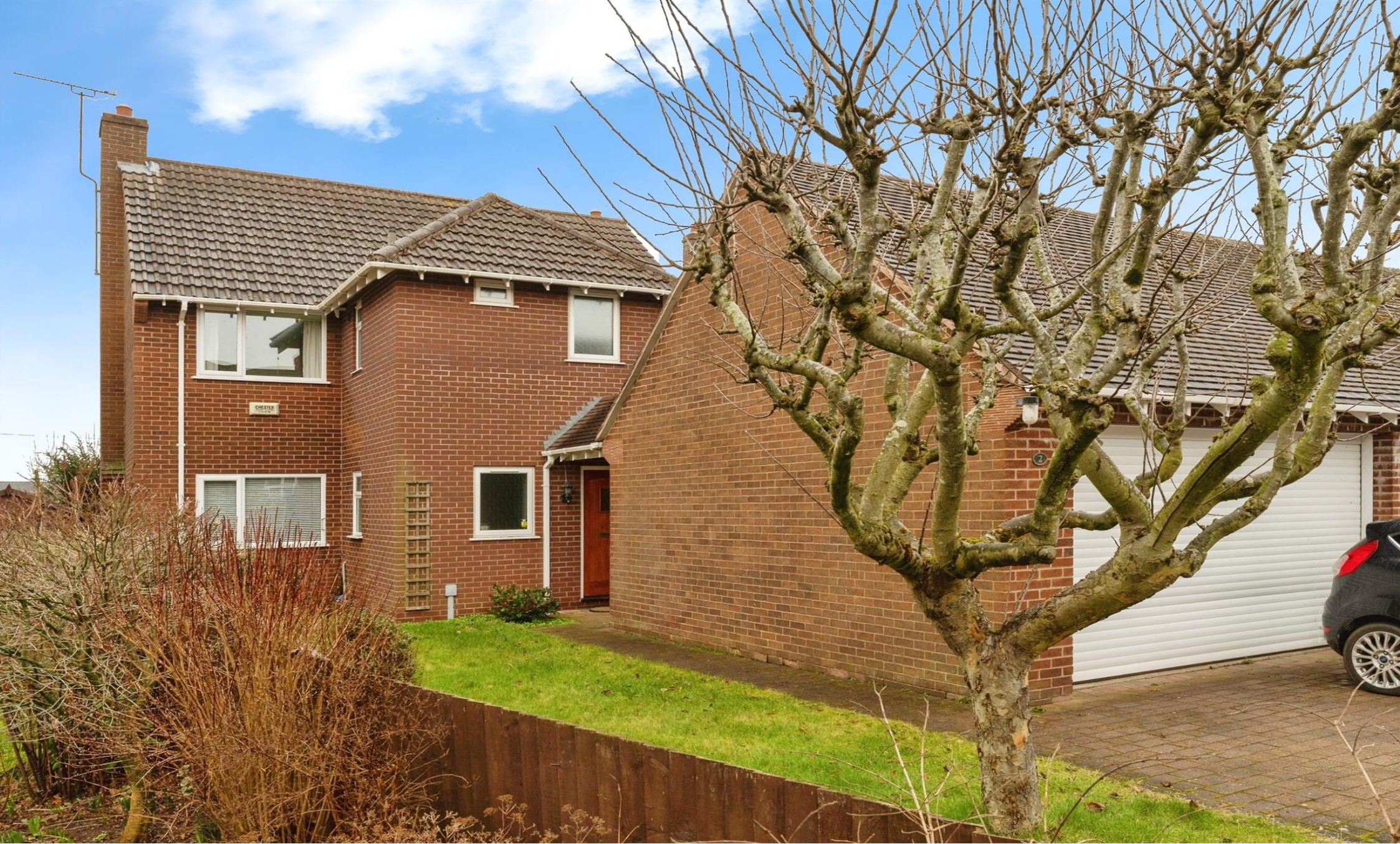
Old Stack Yard, Village Road, Great Barrow, Chester CH3 7JE