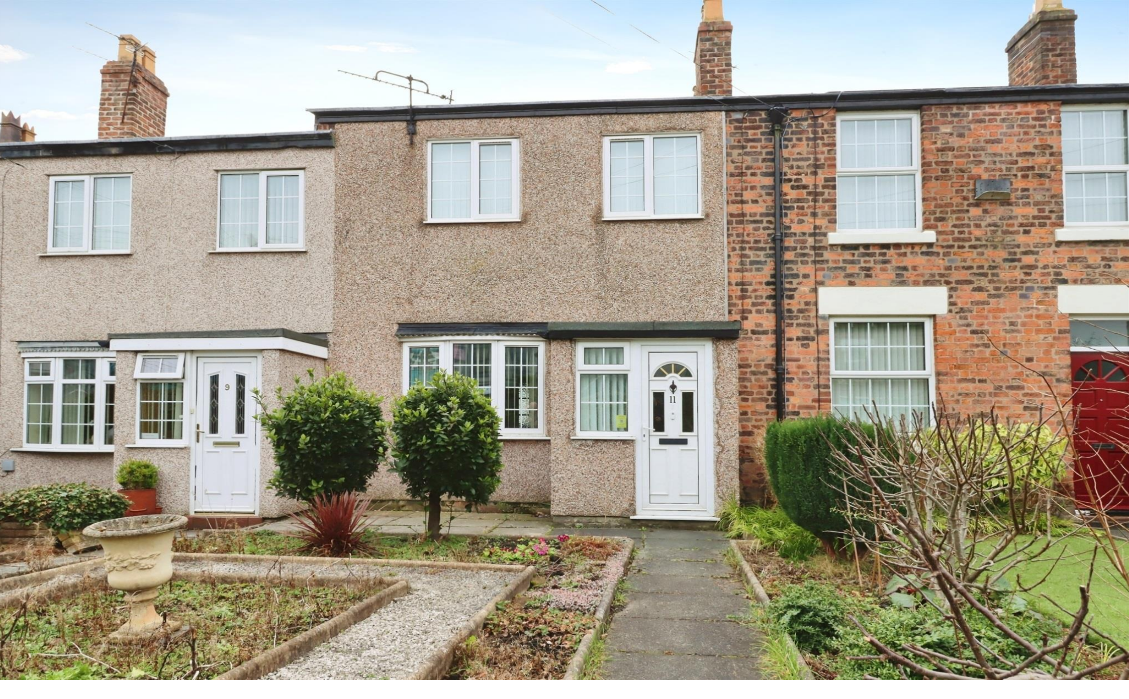
High Street, Saltney, Chester CH4 8SE