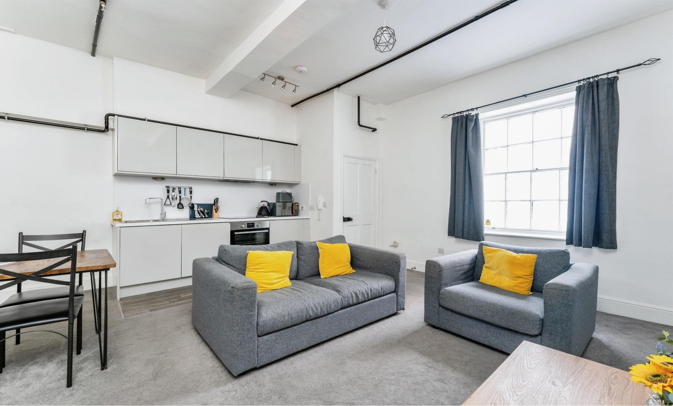
Eastgate Row North, Chester CH1 1LQ